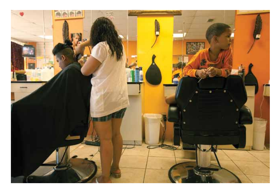
A country of immigrants: A hair salon in Brentwood, N.Y., is one of a growing number of businesses run by or serving Latino immigrants — a trend that has set off an angry backlash in some quarters.

and smacked it against his opposite palm, threatening, "We're going to kill you."