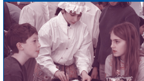
DC Vote Joined Lowell School Students for Their Annual 'Taxation Without Representation' Tea Party