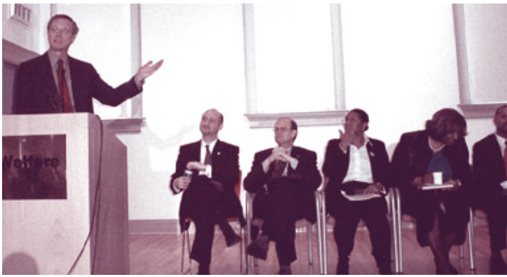
Panelists Discuss Future Activities at the DC Voting Rights Summit