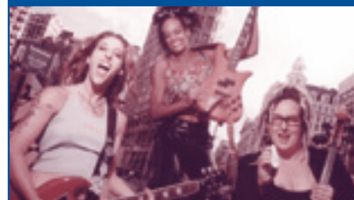
The Rock Group 'Betty' Held a Benefit Concert of Their Show 'Betty Rules' for DC Vote in March