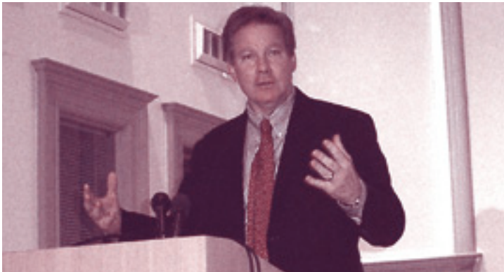
Rep. Tom Davis Gives His Support for DC Representation in Congress