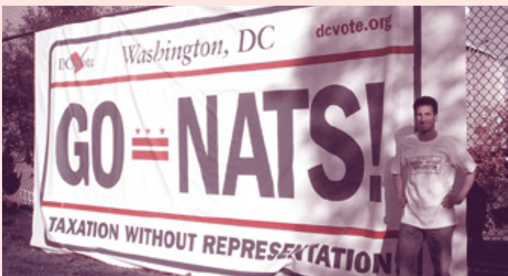
Raising awareness and cheering on the Nats at home opener, this 20'x10' banner featuring DC Vote hangs outside RFK stadium and was mentioned in dozens of media stories across the country.

DC Vote thanks all our members nationwide for their overwhelming support for this membership drive and their continuing dedication to our mission.