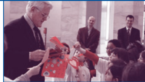
DC Young Suffragists Ask Senator Kennedy and Others to 'Be Mine' on Valentine's Day

Thirteen percent of those surveyed said DC should not have full voting rights, and five percent said they did not know. Of those who opposed equal voting rights, 28 percent favored granting the District at least a vote in the House.