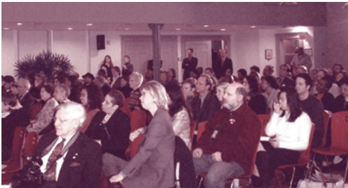
Hundreds Attended January's DC Voting Rights Summit