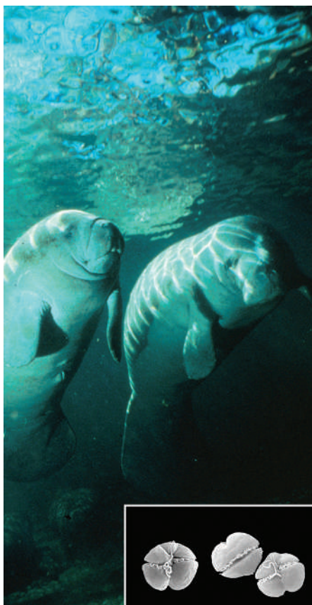
Florida manatees (3 metres long, on average) are susceptible to toxins from the red tide alga Karenia brevis (inset; cell diameter, 30–35 mm).

Brevetoxin poisoning in humans has so far been restricted to the consumption of contaminated shellfish (neurotoxic shellfish poisoning). Although the accumulation of brevetoxins in live fish to the levels measured in the menhaden is probably short-lived and unusual, this finding, together with the dolphin deaths (given that dolphins are a sentinel species 9 ), raises concerns that humans could also be poisoned by contaminated fish.