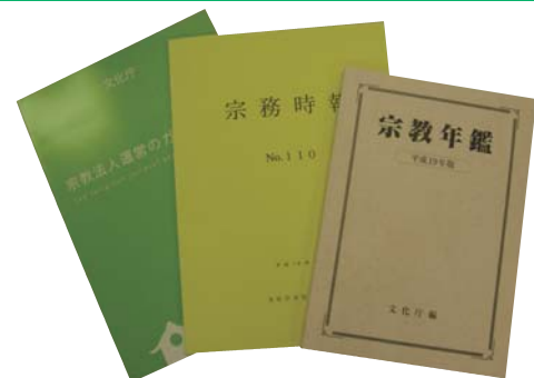
The “Religion Yearbook” and other publications

In addition to collecting statistical data concerning religion, the Agency for Cultural Affairs also compiles and publishes the annual “Religion Yearbook” and other publications.