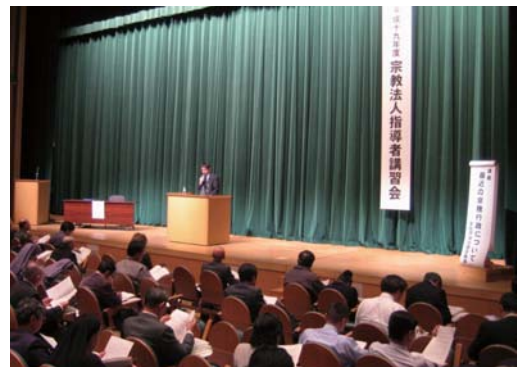
A lecture for leaders of religious juridical persons

In addition, as regards so-called inactive religious juridical persons, the Agency promotes the resolution of their inactive state through merger and dismissal.