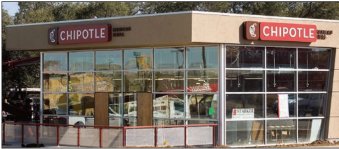
Chipotle Mexican Grill opened its doors in Pueblo a year ago on North Elizabeth Street.