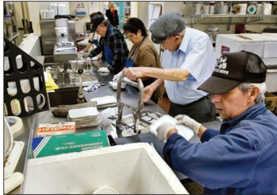
Workers and volunteers at the SRDA pack meals for the daily delivery in Pueblo.

According to a report in The Pueblo Chieftain , Liberty Point was referred to as one of Pueblo's scenic attractions.