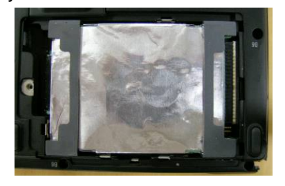
Shock absorber material is added around the hard drive disk and works as a corner bumper mechanism

protection designed to improve the durability of the hard disk drive. Shock absorber material is added around the hard-drive disk and works as a corner bumper mechanism, which buffers the shock from physical drop.