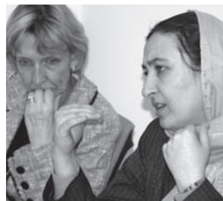
Equal Opportunity Freedom House brings together advocates and officials from around the world to share strategies for advancing women's rights.

Freedom House has developed programs that support human rights defenders throughout the world. In Kyrgyzstan, for example, Freedom House helped to establish the Voice of Freedom, a nationally-registered nongovernmental organization that coordinates the efforts of human rights defenders from across the country. The organization provides these activists with resources and information, and assists them in forming vital networks with like-minded advocates throughout the country, the region, and the world.