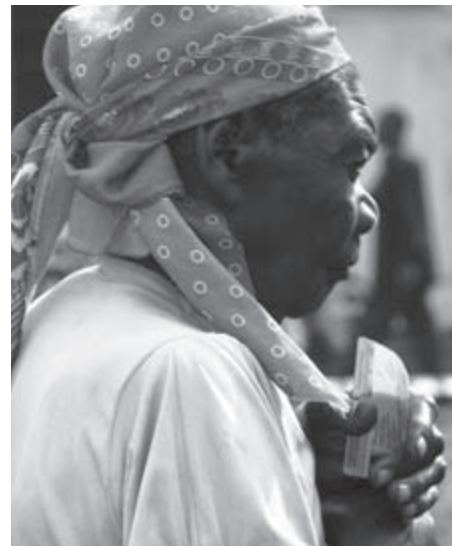
First Time Voter A woman clutches her voter card on the way to a polling site in the Democratic Republic of Congo.

Examining more specific elements of democratic growth, Freedom House produces two additional annual surveys. Nations in Transit monitors progress and setbacks in democratization in the former communist world of eastern Europe and the former Soviet Union, while Countries at the Crossroads examines government performance in 60 key countries worldwide. Freedom House also issues periodic, region-specific assessments and special reports, including Today's American: How Free? , an in-depth examination of the state of freedom in the post 9/11 United States.