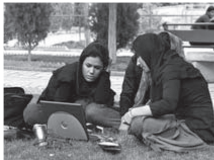
Global Link Gozaar, Freedom House's web-based Persian-English journal, provides young Iranians with a monthly forum for discussing democracy and human rights.