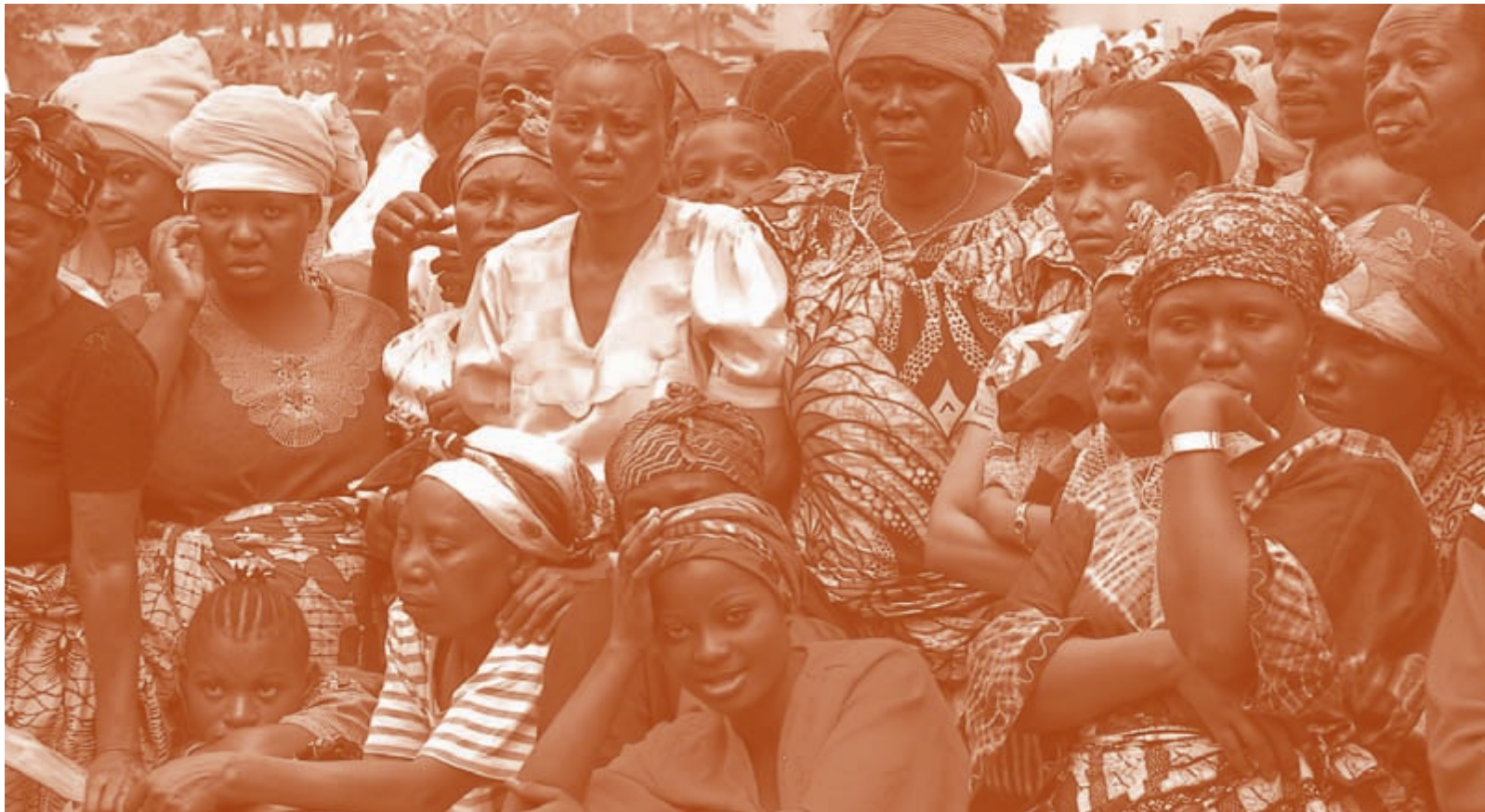
Freedom to Choose Women in the Democratic Republic of Congo queue for their first multiparty elections in more than 40 years.