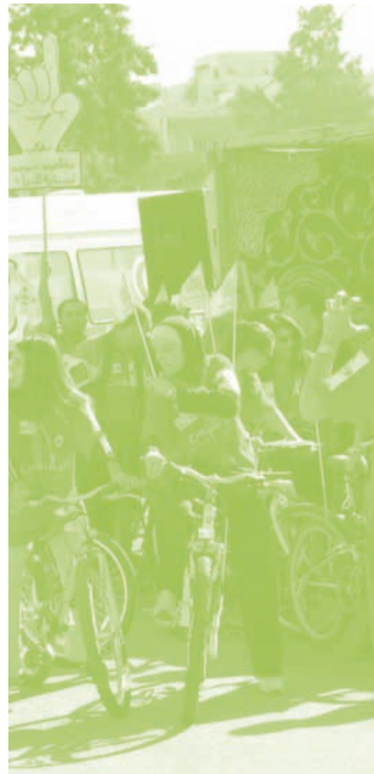
Riding for Rights The National Forum for Youth and Culture in Jordan organized a bicycle ride in conjunction with a parliamentary petition that demanded more laws to protect women.