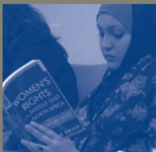
Gender Gap Women's Rights in the Middle East and North Africa , a Freedom House publication, details the unequal status of women in 16 countries and one territory.

A free and independent media is a fundamental guardian of democracy, ensuring government accountability and promoting the free flow of information within a society. This publication tracks trends in media freedom around the world, ranking the level of press freedom in each country.