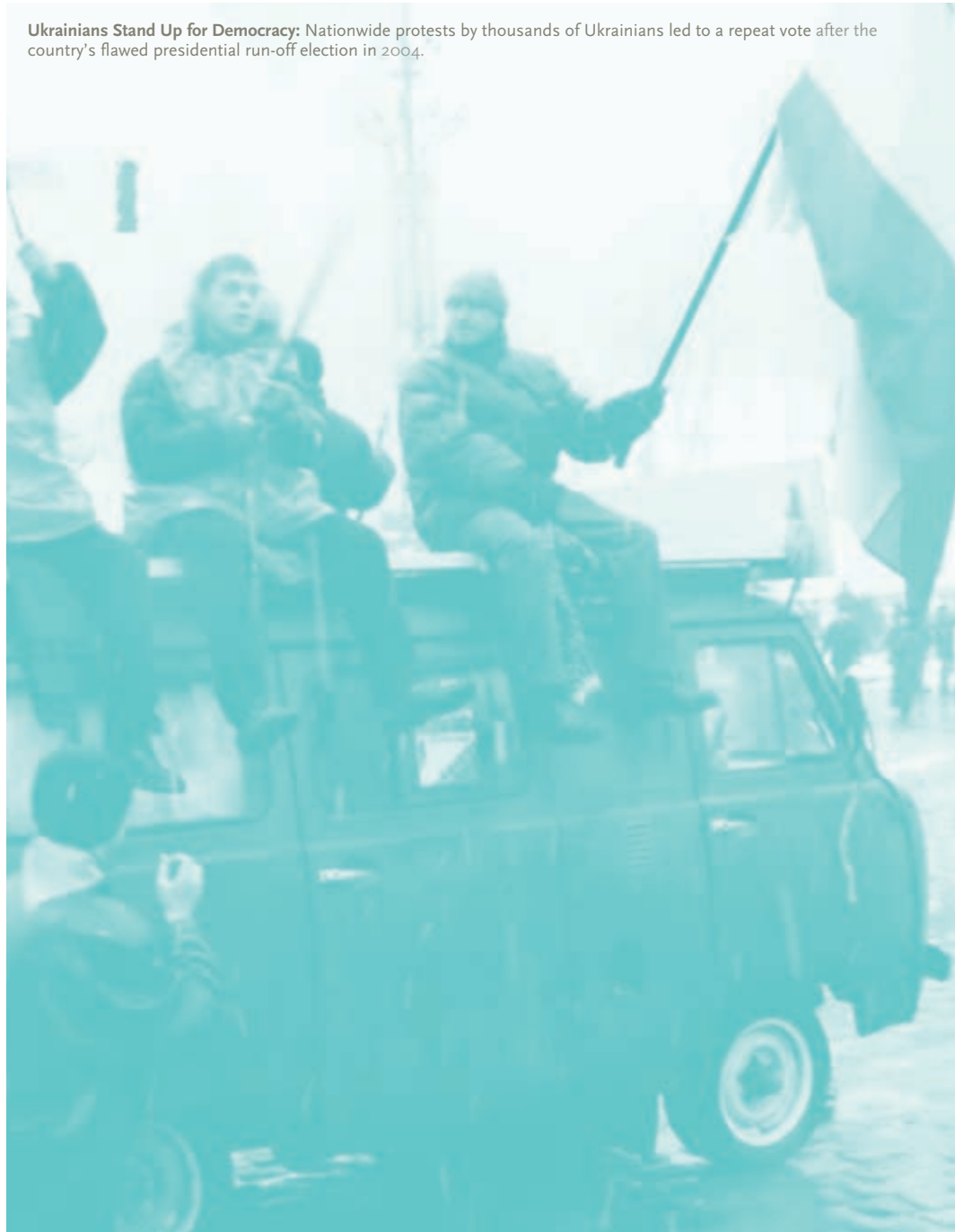
Ukrainians Stand Up for Democracy: Nationwide protests by thousands of Ukrainians led to a repeat vote after the country's flawed presidential run-off election in 2004.