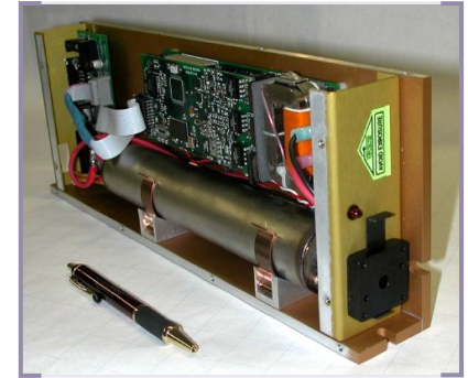
Series 30 Laser with integrated controller (cover removed)