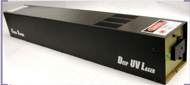
Series 70 Laser with integrated controller