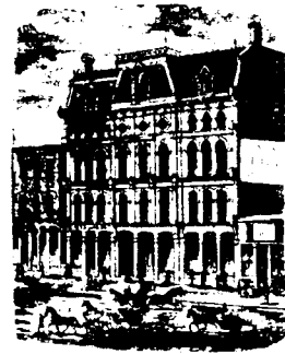
Opera House, Mansfield

Quarterly Newsletter of the Richland County Chapter Ohio Genealogical Society ISSN 1083-7833