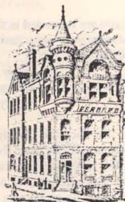
Mansfield Savings Bank

Richland County Chapter, OGS P.O. Box 3823, Mansfield, OH 44907-3823 http://www.rootsweb.com/~ohrichgs