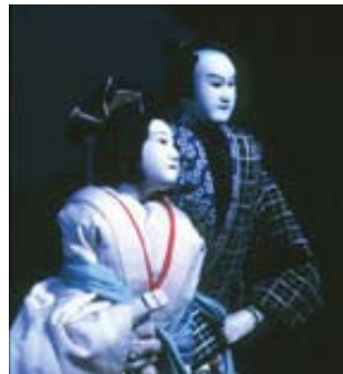
Above: Actors Nakamura Ganjiro and Nakamura Kanjaku of Shochiku Grand Kabuki – Chikamatsu-za perform Sonezaki Shinju ( Love Suicides ).