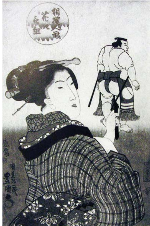
Illustration from 1840 of Otome Bunraku

While Bunraku puppeteers traditionally have been male, women puppeteers and puppet builders participated in Otome Bunraku (female Bunraku). Instead of three puppeteers moving one puppet, in this style of Bunraku only one person operates the puppet. The puppeteer fixes the puppet to her body and wears a kind of head-brace with wires that attach to either side of the puppet's head. This allows any head movement made by the puppeteer to be mirrored by the puppet. The hands of the puppet may have movable joints, or the puppeteer may use her own hands to represent the puppet's by slipping them through the puppet's sleeves.