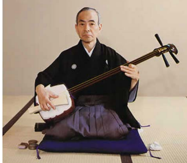
Puppet masters and National Living Treasures bring the characters to life, sharing passionate and tragic tales.