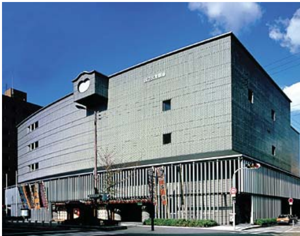
The National Bunraku Theater in Osaka, Japanan

After World War II, Bunraku depended on government support for its survival. However, its popularity has increased over the years. Bunraku is thriving again in Tokyo and Osaka, and performance tours by The National Puppet Theater of Japan have been enthusiastically received in cities all around the world.