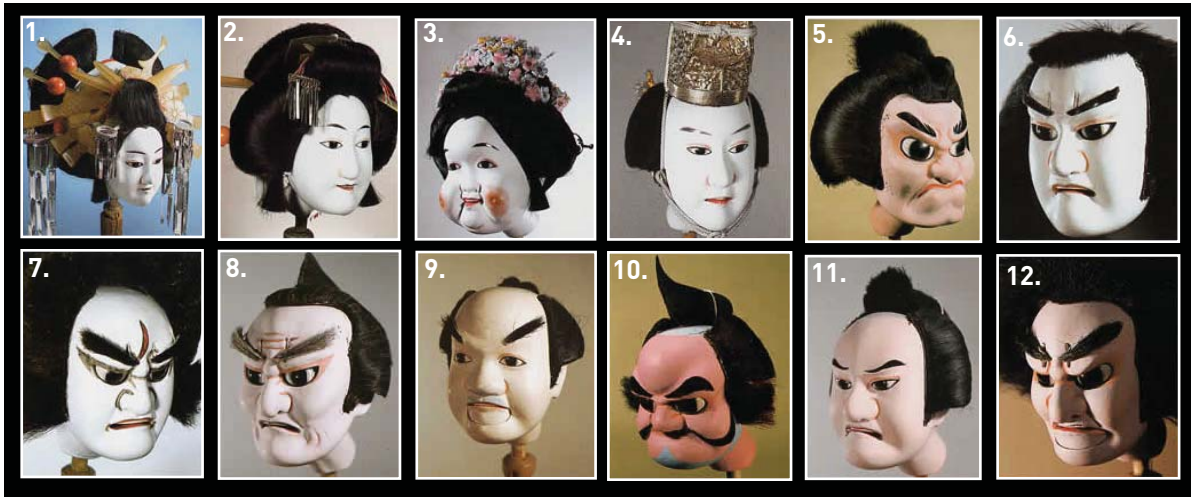
Bunraku puppets showcase a variety of characters that have a specific age, social class, personality, and facial characteristics. Left to right: 1. Beautiful young countess of high class; 2. Young maiden or wife; 3. Comedic middle aged maiden; 4. Young and handsome teenager; 5. Large-minded samuri; 6. Handsome and noble man; 7. Passionate, tragic and handsome hero; 8. Strong, wise and noble older man; 9. Trustworthy man from town; 10. Comedic and somewhat likeable villain; 11. Minor villain; 12. Big hearted, noble and handsome supporting hero.

in the shoulder board. While female puppets are often made with immovable faces, the grip sticks in the heads of male puppets are fitted with control springs to move the puppet's eyes expressively, raise his eyebrows in surprise, and open and close his mouth. In plays with supernatural themes, a puppet may be constructed so that its face can quickly transform into that of a demon.