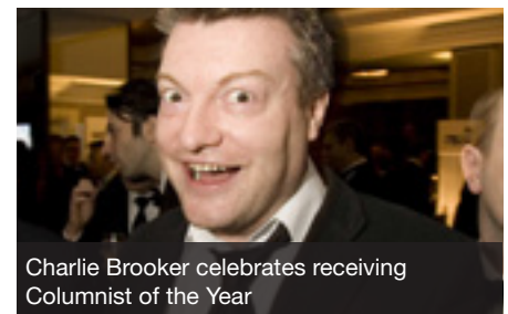
Charlie Brooker celebrates receiving Columnist of the Year