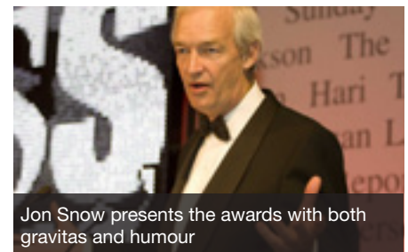
Jon Snow presents the awards with both gravitas and humour