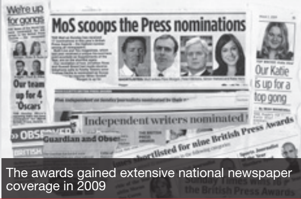
The awards gained extensive national newspaper coverage in 2009