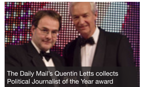
The Daily Mail's Quentin Letts collects Political Journalist of the Year award