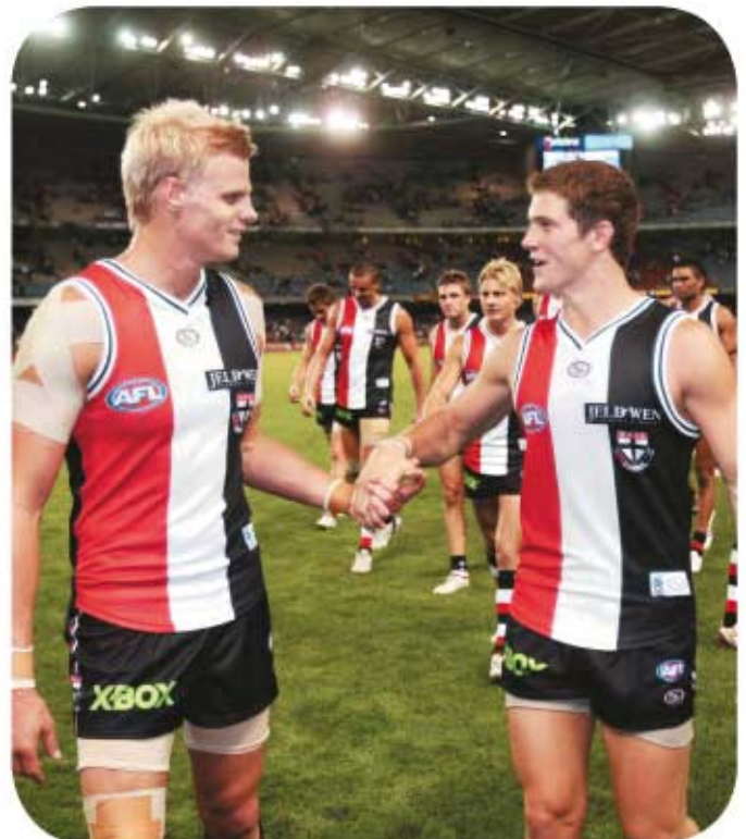
Nick Riewoldt and Nick Dal Santo St Kilda