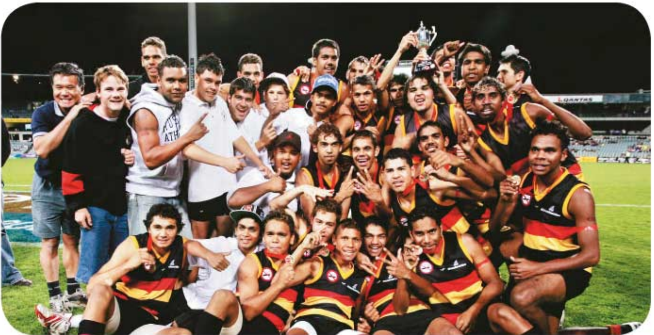
Clontarf Academy football team.

When you have determined your answers and double-checked your calculations, you can see your classroom teacher who will give you a clue that your team will need for the final puzzle.