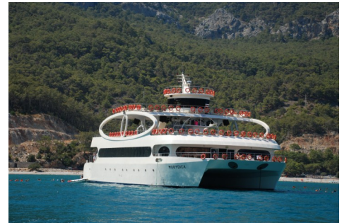
Don't miss this unique experience!

Club Arma is Antalya's most luxurious restaurant where everyone will enjoy first class sea food and excellent, selected Mediterranean specialties.