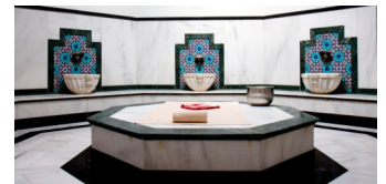
Hamam (Turkish bath)

If you still have energy left in the evening, there is a very special after midnight dancing party at the most famous disco of Antalya