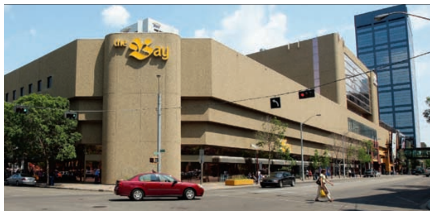
JOHN LUCAS, THE JOURNAL

The recent LRT extension expanded our potential territory for retail therapy. What's your pick?