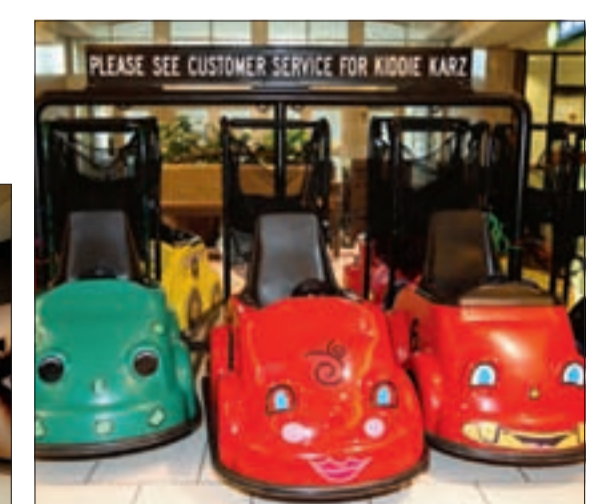
CANDACE ELLIOTT, THE JOURNAL

Nice couches, attractive benches and plenty of them (in 11 separate areas) for tired shoppers and dragged-along grandpas, dads, huddies and boyfriends. A few too many plastic plants, but you take the bad with the good.