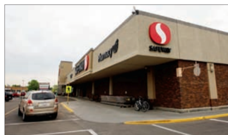
CANDACE ELLIOTT, THE JOURNAL