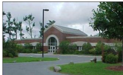
Marshall Dental Clinic