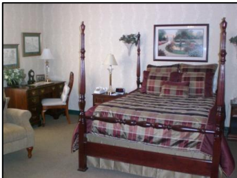
The Inn at Fort Drum Non-appropriated Fund Activity

Non-appropriated Fund (NAF) activities spent $2,061,544 locally in FY09, for a myriad of products and services such as self-help construction supplies and equipment, decorations, furniture, small renovation projects, bedding, linens, washers, dryers, propane, gas, oil, tools, lawn maintenance equipment and supplies, uniform contracts, office supplies and equipment, advertising, and package delivery services.