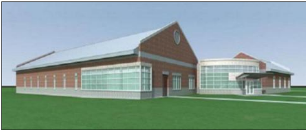
Stone Dental Clinic and DENTAC HQ

In 2009, the DENTAC spent $2,945,900 for dental supplies, equipment, and contractor salaries. An estimated $2,000,000 was paid to local civilian dental practices for services provided for our Soldiers. The DENTAC's civilian payroll for FY09 was $2,203,900 and is included in the civilian payroll total for Fort Drum.