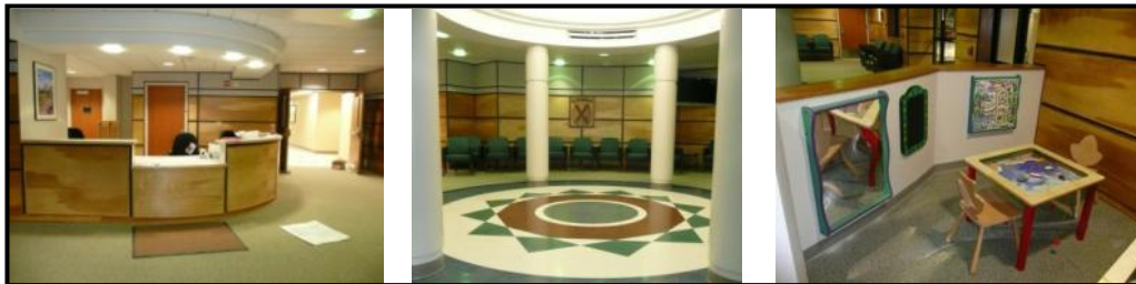
Behavioral Health Clinic Renewal

The MEDDAC is comprised of many different sections located in various buildings throughout Fort Drum. Connor Troop Medical Clinic provides primary medical care for active duty Soldiers. Primary Care and Specialty Care are available at the Guthrie Ambulatory Health Care Clinic for Family members, retirees, and a small number of active duty beneficiaries. In-house specialties include Family Medicine and Pediatrics, Dermatology, Podiatry, Orthopedics, Physical Therapy, Chiropractic Care, Occupational Therapy, and Immunizations. The off post MEDDAC clinic in Watertown offers Obstetrics and Gynecology care to Soldiers and their Families. The Behavioral Health Department on South Post includes Community Mental Health Services, Social Work Services, and the Army Substance Abuse Program.