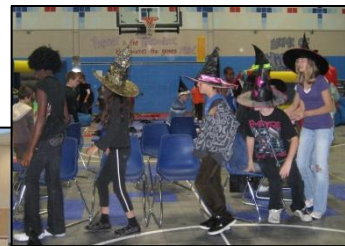
Youth Services Non-appropriated Fund Activity