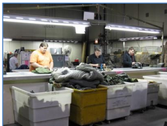
Central Issue Facility Contracted Operated Activity