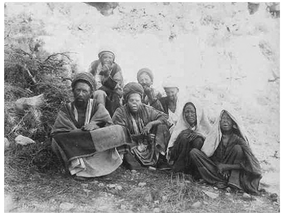
Lepers in Jerusalem, ca. 1880. This photograph and many similar ones contributed to the exoticization of the biblical imagery of the Holy Land.

This essay will address features of this corpus that constitute a nativist ethnography of Palestine during the Mandate period. I use the term 'nativist ethnography' (and 'nativism' as an accompanying ideology) to refer to the attempts to establish sources of legitimation for Palestinian cultural patrimony (and implicitly for a Palestinian national identity that began to distance itself from greater Syrian and Arab frameworks).