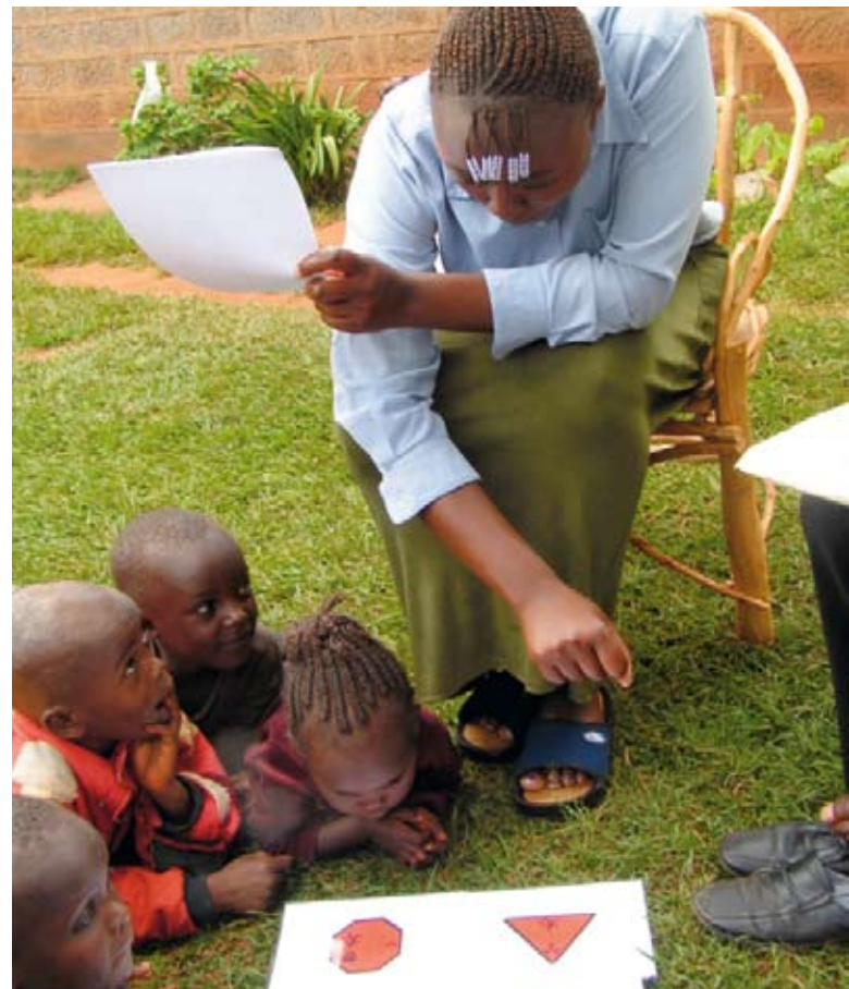
Participants in 11 countries helped zero-in on the most effective symbol to convey “danger”. Here, a Kenyan woman ponders the graphic options presented to her by Gallup pollsters.