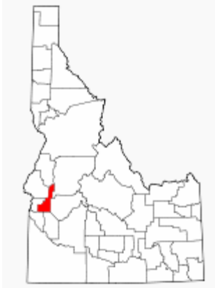
Gem County, Idaho

Several Christian Exodus members realize that due to commitments to extended family or other reasons, they will not be moving to South Carolina.