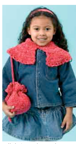
click to enlarge image schematics

Chain (ch), Double crochet (dc), Single crochet (sc), Slip stitch (sl st)