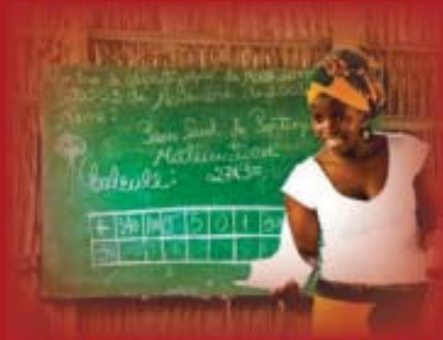
Educating the children and youth

In response to the pressing issues facing mankind, members of the Federation implement a number of programs. They include education, community development, fighting HIV & AIDS, agriculture, food security and protection of the environment.