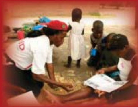
Individual counseling to control HIV/AIDS

“When being a grown up means never becoming old, we become part of the struggle against the plague and the war.”