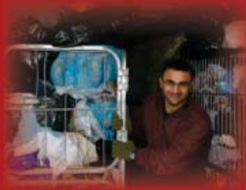
Protecting the environment through collection, processing and sale of second hand clothes