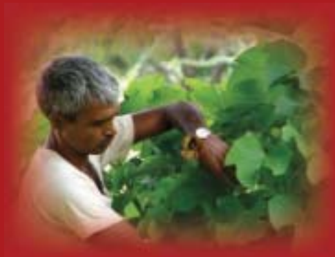
Training farmers to increase income