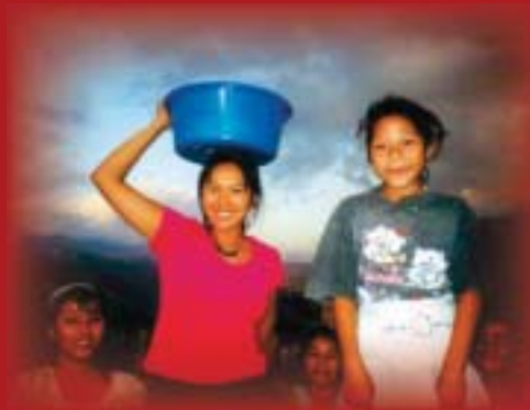
Organizing families to improve their own living conditions