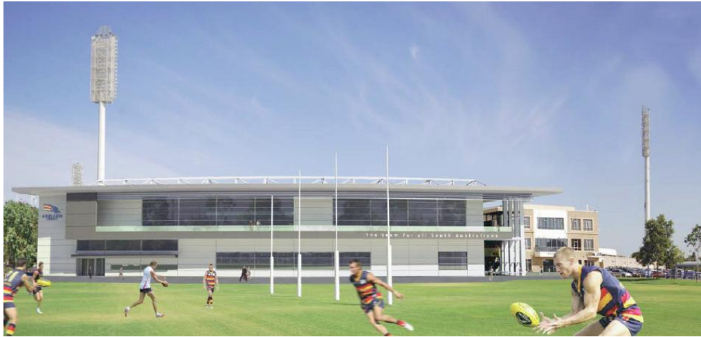
Impression from outside of the new Adelaide Crows Training and Entertainment facility at AAMI Stadium