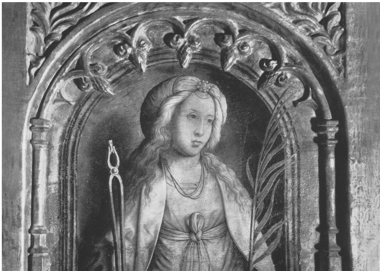
Saints Apollonia and Mary Magdalen (after restoration), by Juan de Flandes, painted for the Salamanca