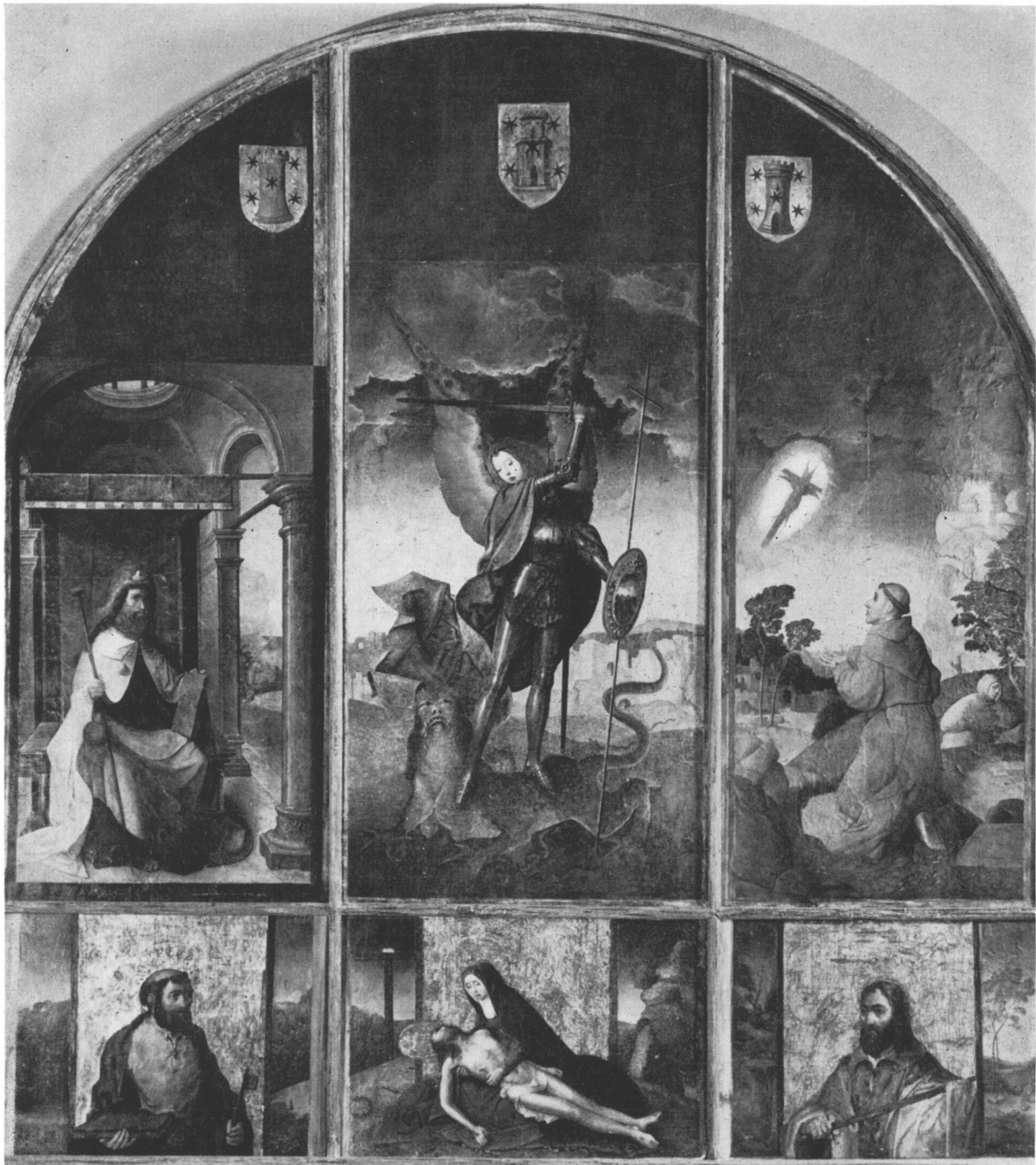
Old Cathedral retablo, Salamanca, by Juan de Flandes Museo Diocesano, Salamanca

jacent niche. The archangel is shown again at the center of the retablo painted by Juan de Flandes above the tomb, in a position similar to that of the sculptured figure in the next niche. Thus three images of Saint Michael are associated with the Rodriguez tomb.