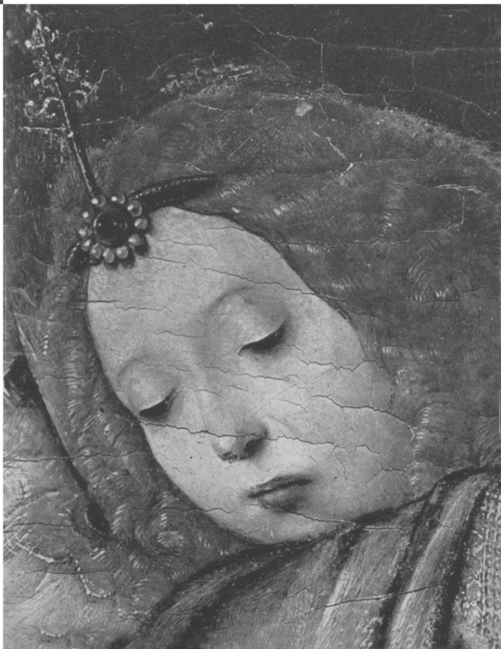
BELOW: The head of Saint Michael, from the Old Cathedral retablo, Salamanca

Of all the saints, Michael is probably the one most frequently depicted in Spanish art. The militant archangel is identified in Daniel xii:1 as "the great prince which standeth for the children of thy people." His sculptured presence above the tomb in Salamanca and in the adjacent painting by Juan de Flandes may stem from the archangel's role at the time of the Last Judgment, as described in the offertory in the First Mass for the Dead. In this prayer Christ is implored to deliver the dead from hell, that "they may not fall into darkness; but may the holy standard-bearer Michael introduce them to the holy light." The golden background in our painting may be an allusion to such light, indicating an effulgence of divine illumination surrounding Michael in his victorious combat with the devil as recorded in the Revelation of Saint John the Divine (xii: 7-9): "And there was war in heaven; Michael and his angels fought the dragon; and