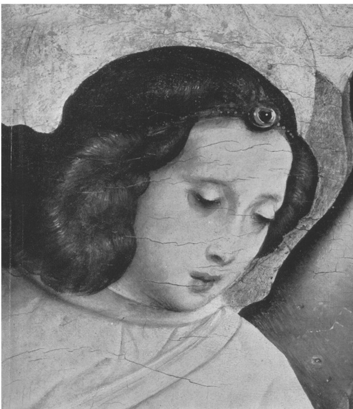
ABOVE: The head of Saint Michael, from the Metropolitan's Saint Michael and Saint Francis