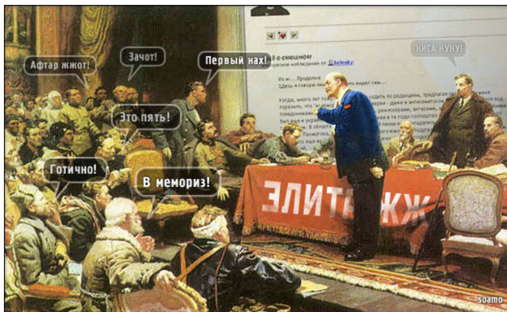
Figure 5. RLJ élite. Collage by soamo (2005).

grammatacalaty” by Mary Shelley (1998) first published at fuck.ru. However, due to the tremendous popularity of LiveJournal in Russia, many tend to consider the jargon as a ‘ZhZh language’ (for examples of typical padonki expressions see Zhargon padonkov, 2006). The padonki jargon is based on using obscenity, word transformations, erroneous spelling and special discursive formulas. The two language devices – inserting double meaning into a message and using a mean, unprintable style – can be traced down to the Soviet time when they were used as defensive linguistic methods against censorship and denunciation (Gusejnov 2002, 2005). The jargon is thus a close relative to the Soviet anecdote culture (see chapter 7). It can be also read in terms of cultural resistance – not only against official discourse but also against globalisation with its ubiquitous English. The jargon has distinct counter-establishment and counter-cultural connotations but it is mostly used as a means of irony, expressivity and play. The degree of RLJ’s influence over contemporary Russian culture is well illustrated by the fact that ZhZh language has infected both media (press, radio and TV programmes) and belle letters (for example, Viktor Pelevin’s [2005] novel “Helmet of Horror”).