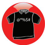
T-Shirts or clothing items with vulgar language or phrasing