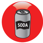
Cans or Bottles bottled or boxed liquids