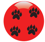
Animals (disability service animals allowed)