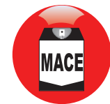
Mace or Pepper Spray