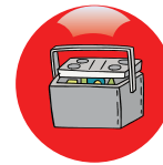
Coolers of any kind including small soft sided coolers