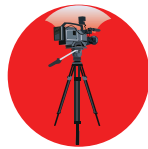
Commercial audio/video recording equipment including tripods