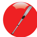
Sticks, Poles, Bats, Clubs