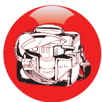
Large Camera Cases