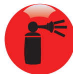
Noisemaking Devices air horns, bells, bullhorns, thundersticks, whistles