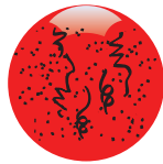
Confetti or Glitter