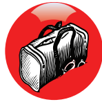
Bags - Large (larger than 8.5" x 11" x 14)