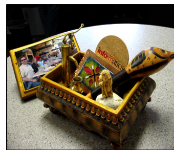
Figure 3. Pitara and Assorted Mementos

using current technologies. When RFID tagged items are placed inside the Pitara, associated photos and video are displayed in the form of a slide show on a small screen attached to the lid of the box (Figure 3). This mobile system serves as a way to share the memory of a loved one or the events of a trip in an extremely useful fashion.