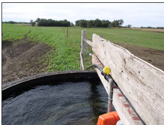
Figure 5b. Tank Supplied by Rural Water with Above Ground Pipeline.

Task 3. Establish riparian improvement projects that include rock crossings and exclusion fencing will help stabilize stream banks and provide suitable stream crossings.