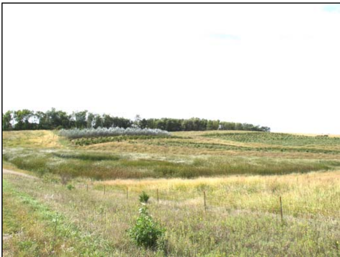
Figure 8a. Wildlife Planting and Buffer.