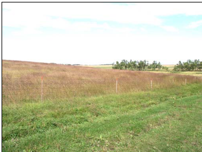
Figure 4a. Rotational Grazing System Dominated by Big Blue Stem.

Accomplished: Technical assistance for the development of rotational grazing systems was provided by the SD Grasslands Coalition through the 319 funded Grassland Planning and Management Project. Three grazing systems totaling approximately 905 acres were installed using plans developed by Grassland Project staff. Development of the systems required the installation of 5,205 linear feet of cross fence. Figure 4a shows one of the paddocks in a system dominated by Big Blue Stem; 4b a cross fence used to divide a pasture into paddocks.