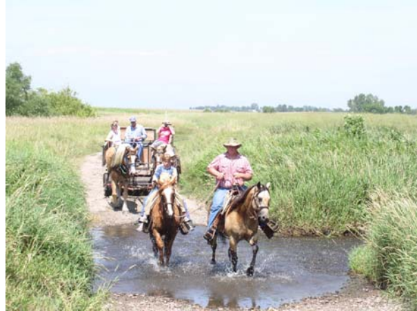
Figure 10b. Team and Wagon Using a Rock Crossing.

Colman-Egan Schools are located in the watershed. The conservation district hosted a field trip for the first and second grade students to view a shelterbelt planting demonstration. The project coordinator gave a presentation on how to and the importance of planting trees. Different types of trees and shrubs were shown and their benefits discussed.