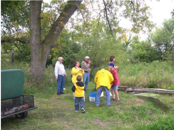
Figure 10a. School for the Deaf Students Fishing.