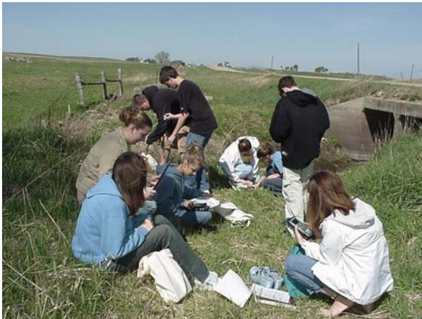
Figure 9a. Water Sampling By Students.