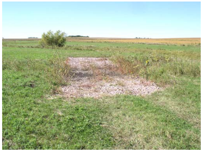
Figure 6b. Rock Crossing.

Task 4. Construct nutrient management systems on feedlots prioritized by AGNPS.