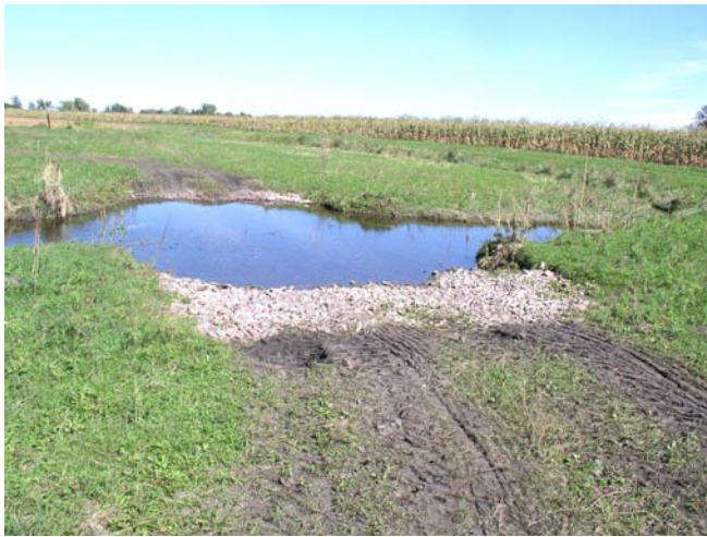
Figure 6a. Rock Crossing.