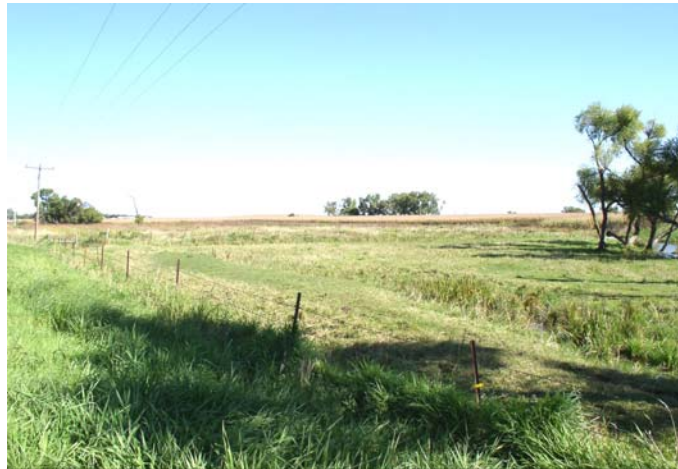
Figure 7. Riparian Buffer.

Accomplished: Buffers (Figures 7 and 8a and b) were installed on 186 acres to exclude livestock from riparian areas. The total acres equals approximately 7.2 miles of stream bank on the tributary and creek main stream. The milestone for the practice was exceeded by 28 percent.