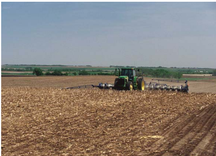
Figure 3. No-Till Planting.

Accomplished: No-till practices (Figure 3) were cost shared on 434 acres identified by using the Agricultural Nonpoint Source (AGNPS) model. The project milestone was 5,000 acres. While no-till was not widely adopted as part of the project, it was found that producers were adopting the practice without cost share assistance. For example, when the project coordinator and the NRCS District Conservationist for Moody County surveyed the project area it was determined that an estimated 50 percent of soybeans were being planted