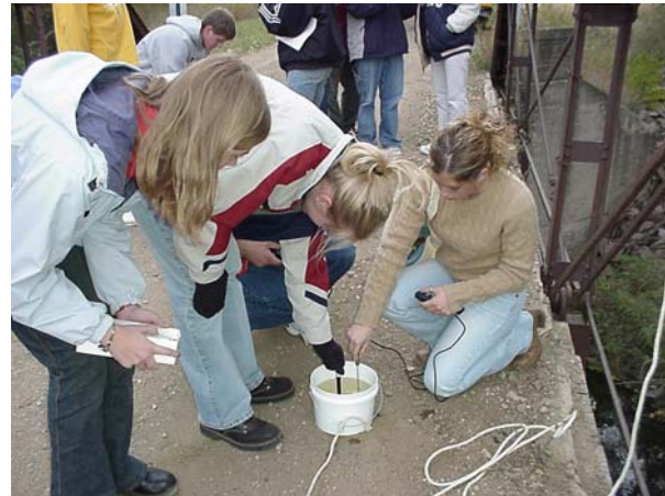
Figure 9b. Students Testing Water Samples.