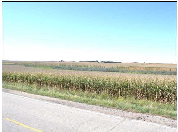
Figure 8b. Riparian Forest Buffer between Crop Fields.

Riparian buffers were installed using the Farm Service Agency’s Conservation Reserve Program (CRP). CRP provides funding to establish riparian buffers and an annual rental payment for up to 15 years. The project coordinator and NRCS provided technical assistance to develop the conservation plan for each tract enrolled in the program. The use of CRP funds for this practice allowed 319 grant funds to be used to install other BMPs needed to attain the project goal.