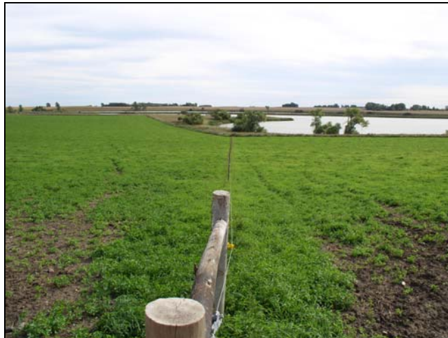
Figure 4b. Cross Fence Dividing Rotational Grazing System Paddocks.

The three systems equal sixty percent of the practice milestone. However, selecting the number of systems as a milestone was probably incorrect. A milestone based on acres would have provided a more