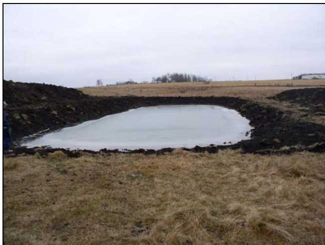
Figure 5a. Dugout.

Accomplished: During the project, five alternative watering sources were installed. Installation was planned for an additional watering source. However, because of wet conditions, installation could not be completed by the end of the project. Additional cost share funding is being sought to install the additional alternative water source. Examples of two types of alternative water sources installed are illustrated in Figures 5a and b.