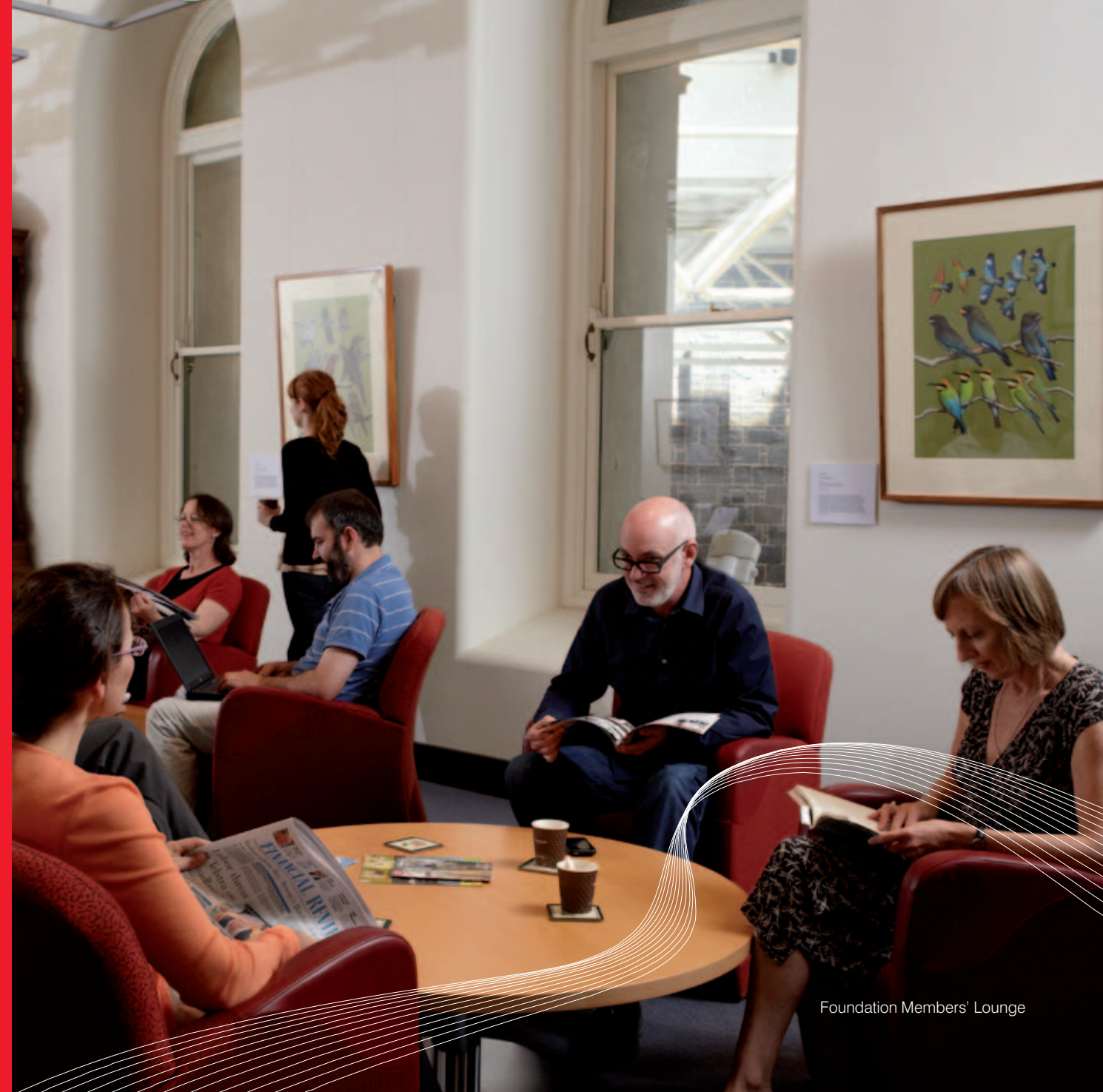
Foundation Members' Lounge