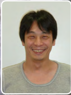
Hajime Tabata – Director

FOR THE FULL INTERVIEW, CHECK OUT ISSUE 44 OF PLAYZINE