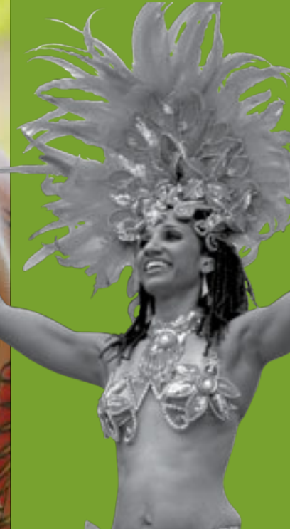
© Britney Bush Bolay/StockPhoto/Eva Serabassas, Alan Krell