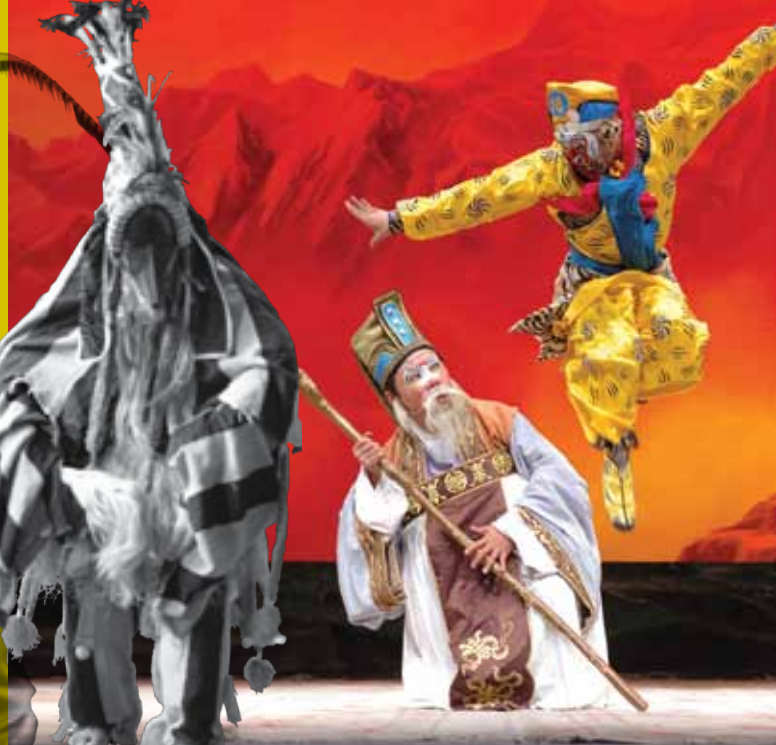
© World Rhythm Festival; Alan Keil; Sichuan Opera Company