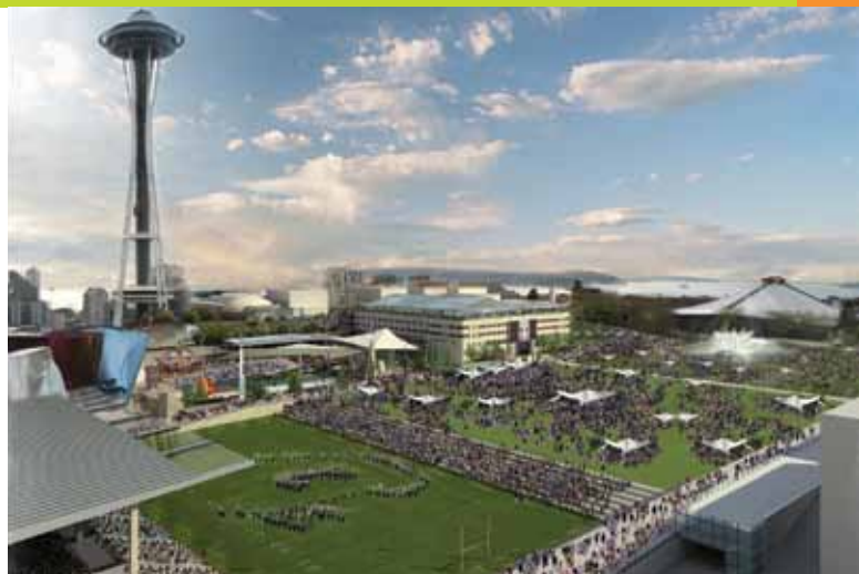
Rendering of future Memorial Stadium

Seattle City Council in 2008 adopted a forward-looking and far-reaching plan crafted by a 17-member citizens committee to guide future redevelopment at the 74-acre Seattle Center.