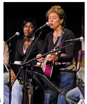
The Freedom Sings band performs.

Freedom Sings is a critically acclaimed multimedia experience with an all-star cast of musicians, now in its 10th year of touring the country. The presentation features music that has been banned or censored or has sounded a call for social change, and it invites audiences to experience the First Amendment in a new way. This entertaining, irreverent and inspiring program is packed with live music, video and narration, and showcases