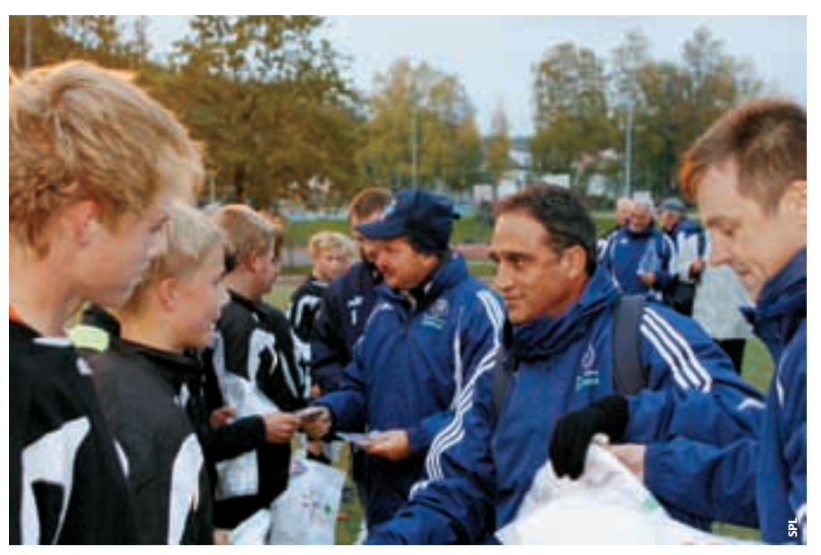
Thanking the demonstration group in Finland.

However, it didn't come to an abrupt end when the visiting teams headed home from Helsinki airport. The principles of the Study Group Scheme insist on the creation of a logbook and the pursuit of follow-up activities, in addition to feedback to UEFA by both the host and visiting associations with a view to upgrading the visits as the project goes on. Indeed, the scheme's mission document makes it clear that the idea is for the value of the visits to last far beyond the four days. "Upon completion of the visit," it reads, "the study group will act as multipliers by disseminating information and ideas to as many colleagues as possible." In other words, the aim is to ensure that the long-lasting benefits to grassroots football endure way beyond the end of the project in June 2012.