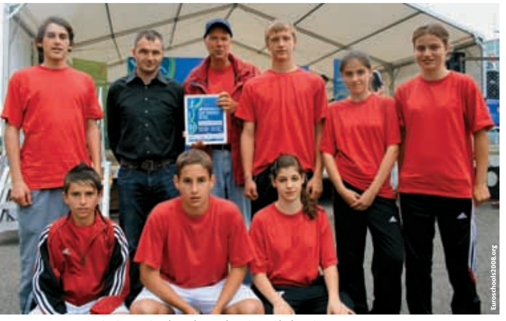
Former Swiss international Stéphane Chapuisat with the winners of the EUROSCHOOLS tournament in Berne.

There was also football, of course. During the run-up to EURO 2008, eight-team local and regional tournaments were organised – and they were no ordinary tournaments. Teams comprised three boys and three girls from the 12 to 15 age bracket and matches were 4v4 on 15x10m pitches with neither goalkeepers nor referees. Two girls had to be on the pitch at all times and the goals scored by the boys were only declared valid when one had been scored by a girl. The other unusual feature was the prematch dialogue zone in which each