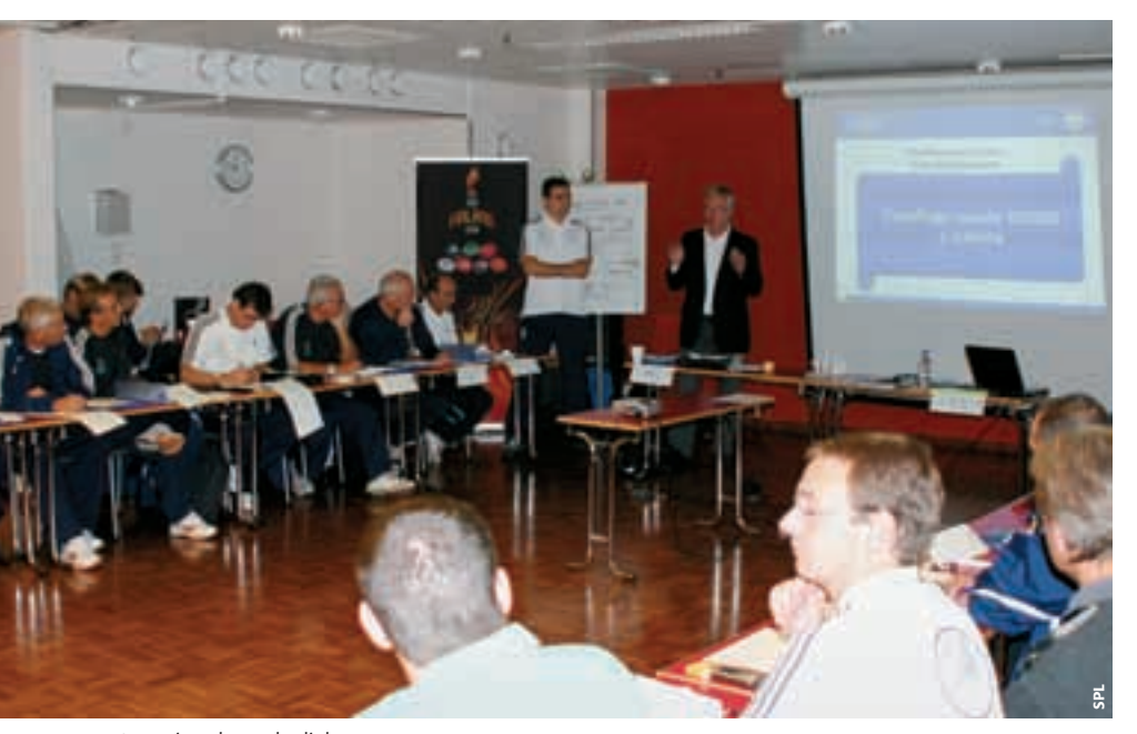
Learning through dialogue.

The four-year project kicked off in the Austrian city of Linz where, although the event was not grassroots-specific, the emphasis was on the related topic of talent development. Youth football was the theme of the event staged in Croatia, while elite youth football was the topic when the Swiss national association acted as host. By the end of October 11 visits had been completed and the plan is for 52 to be carried out by June 2009, when the scheme will have run its first full year. By that time, 23 of UEFA's member associations will have acted as hosts to 149 teams of visitors.