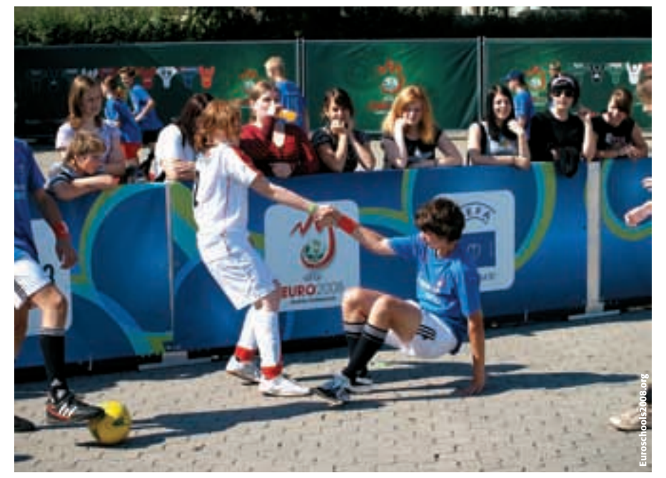
EUROSCHOOLS focused on fair play.

and some good, cosmopolitan company. But the fan zones were also the focal points for intensive grassroots activities similar to those provided at the Champions Festival built for the UEFA Champions League final in Moscow and similarly supported by the event's commercial partners.