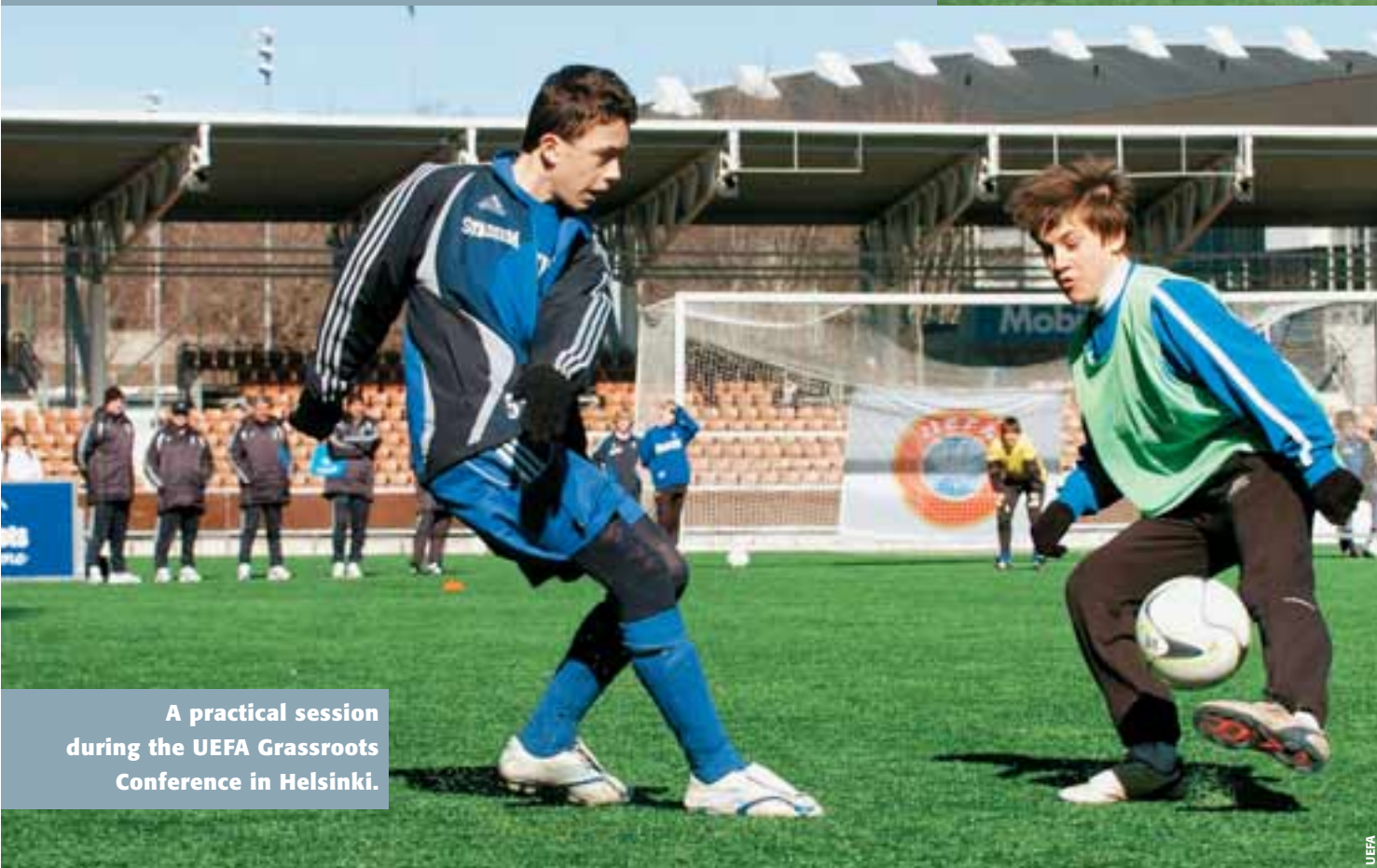
A practical session during the UEFA Grassroots Conference in Helsinki.