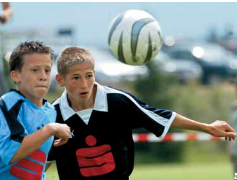
A competitive spirit, but without forgetting respect for fair play.

provide appropriate conditions for learning the basics. It has been said that today's child is a creature that stands halfway between an adult and a TV set. We would prefer that they ran (with a ball) between two goalposts!