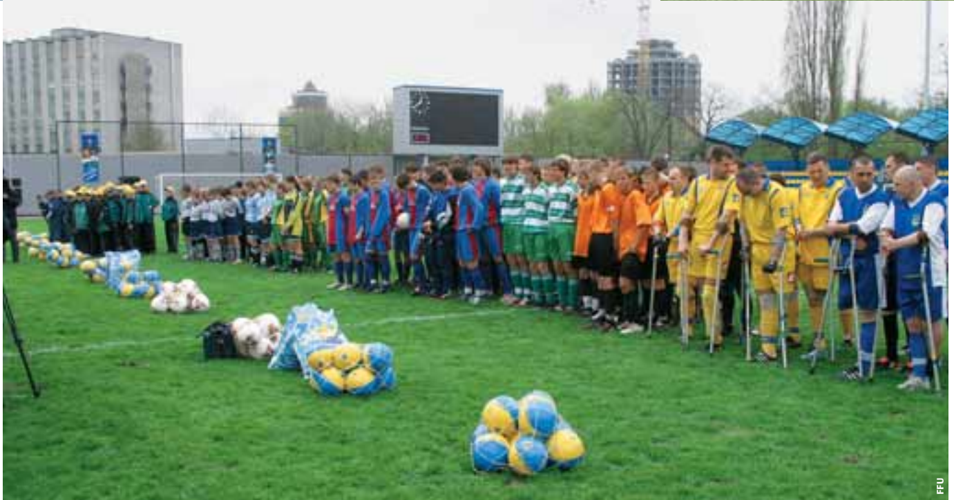
Grassroots football also includes disability football.