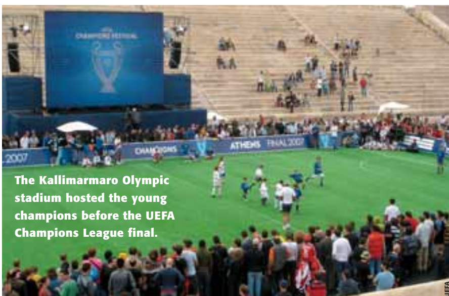
The Kallimarmaro Olympic stadium hosted the young champions before the UEFA Champions League final.

In the meantime, the success of the event had prompted adidas to team up with UEFA in the creation of a UEFA Young Champions tournament aimed specifically at grassroots players between the ages of 9 and 14. The ancient Kallimarmaro Olympic stadium provided a magnificent setting for the event and it speaks volumes for adidas' commitment to the grassroots cause that, even though none of their branding was permitted in the ancient