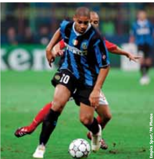
FC Internazionale: active not only in the UEFA Champions League but also in grassroots football.

In sporting terms, the structure translates into the senior team, an U23 team and 11 youth teams (U11 to U19) under the umbrella of the business company, with four senior teams and 23 junior teams (U7 to U19) affiliated to the non-profit organisation. But the club maintains that the SV in the non-profit organisation's name