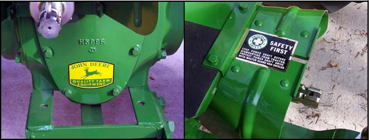
Figure 212 (A&B). On the left, is the later model rear cover decal, JOHN DEERE Quality Farm Equipment. A most discerning observation will reveal that the decal is placed about 1/2 inch too low. On the right is observed correct placement for the SAFETY FIRST decal on the master shield.

"Safety First" decals, 1941 and up -- Install the Safe Driving Speeds decal on the rear of the seat, just above the center hole. Place the power shaft Safety First decal length-wise on top of the PTO Master Shield: It is to be centered, and read from the left side of the tractor. TIP: No master shield, you don't use this decal! See Figure 212B.