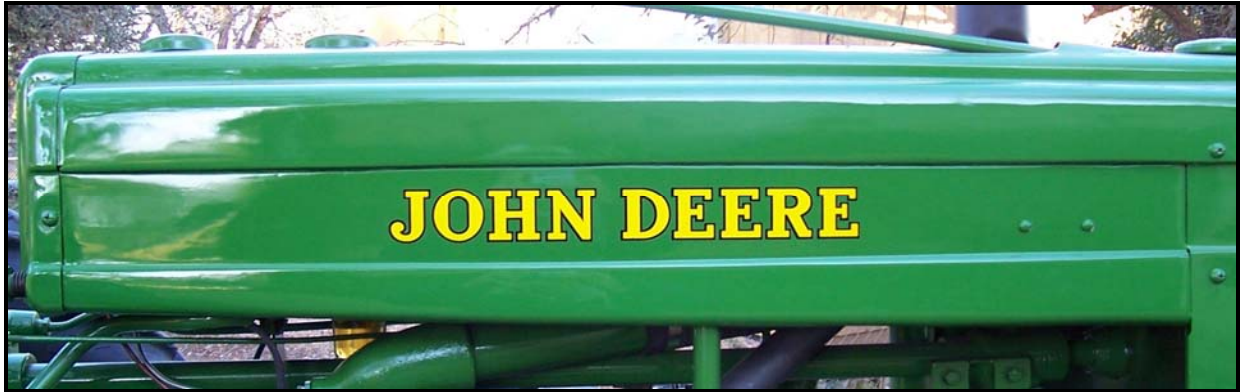
Figure 214. This is the pulley-side. As on the flywheel-side, decal is centered fore and aft on the exposed center plane of the hood.

Vinyl Decal Removal -- If you end up needing to remove a vinyl decal, use a hair dryer to heat corners and gently roll or work back the decal. Be extremely patient and gentle. When finished, a really gentle "massage" with ordinary mineral spirits will remove the decal residue without affecting the hardened paint job. This residue can also be buffed off using very fine buffer wheels and a high-speed drive. Obviously, the decal cannot be salvaged! If you get excited and flustered, call the folks who sold you the decals. They know their product! ++++