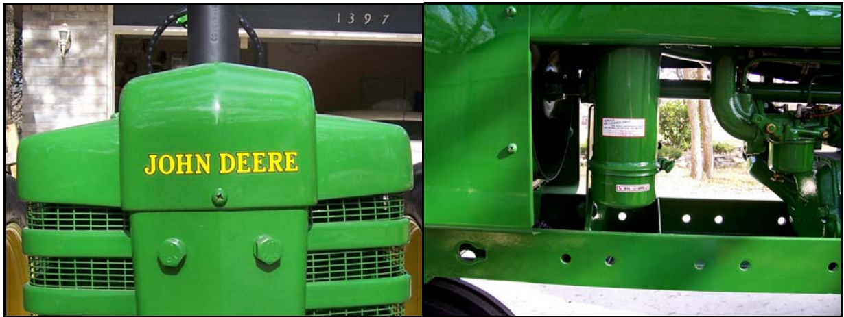
Figure 209 (A&B). Medallion decal on the left, and air cleaner decals on the right.

Decal placement -- Where to place the decals is generally not that hard to figure out. Use the guide sheet furnished by your decal supplier. For some however, a bit of guidance is added here.