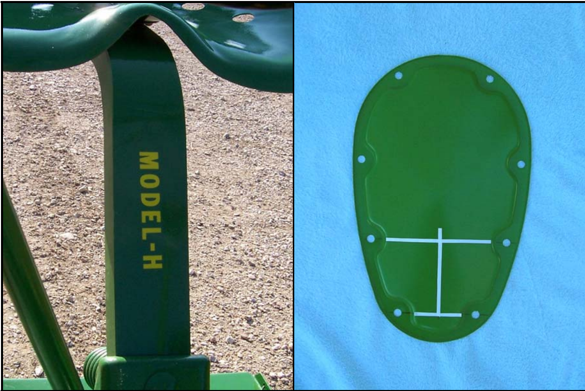
Figure 211 (A&B). On the left you observe placement of the seat channel (support) decal. On the right is a reference illustration for placing the rear cover decal. Decal is centered (right to left) and also centered between the lines connecting the bottom mounting holes, and the 2nd hole up on each side.

The "MODEL H" decal is placed on the seat support channel, roughly centered in the useable space between the bend and the seat support body casting, P/N H369R. Place this decal reading down. The decal for the rear (differential) cover (JOHN DEERE, Moline, Illinois), or (JOHN DEERE Quality Farm Equipment) is centered side to side. Further, it is vertically centered between two imaginary lines drawn, one between the two lower bolt hole centers, and one drawn between the 2nd bolt hole up on each side. If you were to imagine just the lower imaginary line, the bottom of the decal ends up 3/4 inch above such a line for the early decal and 1/2 inch for the bordered decal. See Figures 211B and 212A.