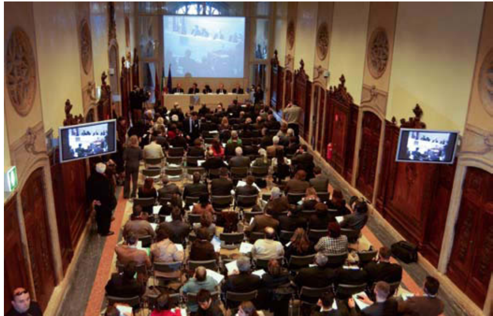
The Venice Conference – 6 th February 2006

The initiative of setting up an Adriatic Euroregion has been launched by the Congress of Local and Regional Authorities (CLRAE) of the Council of Europe with the support of the Region of Istria (Croatia) and the Region Molise (Italy) and has received growing international, national, regional and