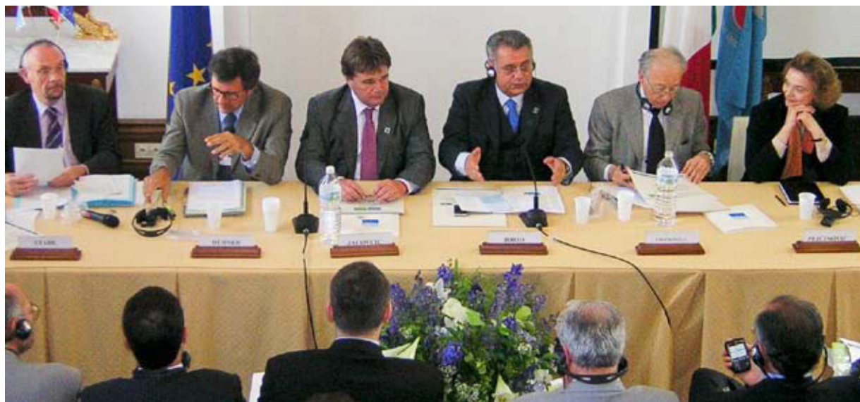
Brussels on the 11 th June 2007