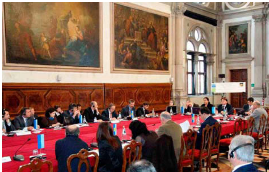
Commissions working meeting – Venice 3 rd and 4 th December 2007

ment; Commission for Fisheries and Commission for Economic Affairs; it was presented the working plan for 2008 and some project ideas were shared between its partners.