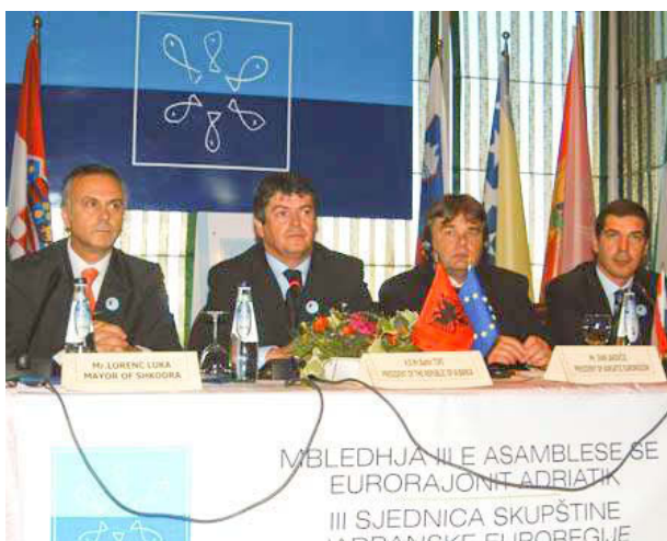
III Assembly meeting of the Adriatic Euroregion, attended by the Albanian President Rami Topi, 2 nd September 2007 Shkodër (Albania)

dent of the Qarku Shkodër prof. Kolombi welcomed the participants and stressed that: