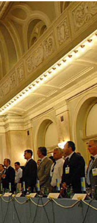
The Assembly – Council of the Adriatic Euroregion - session held on 30 th June 2006 in Pula (Croatia)