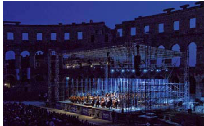
Concert conducted by Maestro Riccardo Muti, Arena amphitheater in Pula, 30 th June 2006

Adriatic is a noble homeland for the millions of citizens living in the area for which it represents at the same time hope and fidget, challenge and destiny, promise and chance. The third millennium has brought new challenges as the global warming, the economic and cultural globalization, therefore the need to find new and innovative answers to these challenges is a