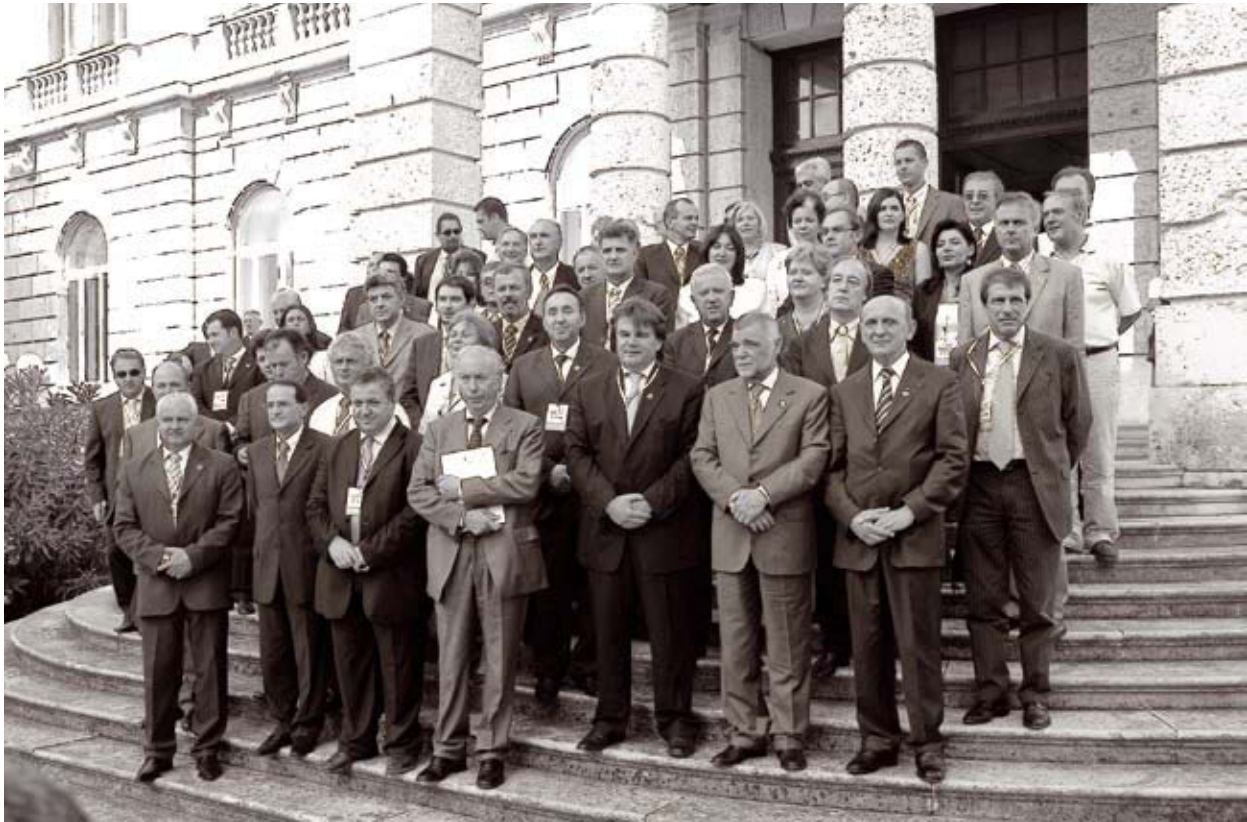
The Assembly – Council of the Adriatic Euroregion - Founding conference held on 30 th June 2006 in Pula, (Croatia)