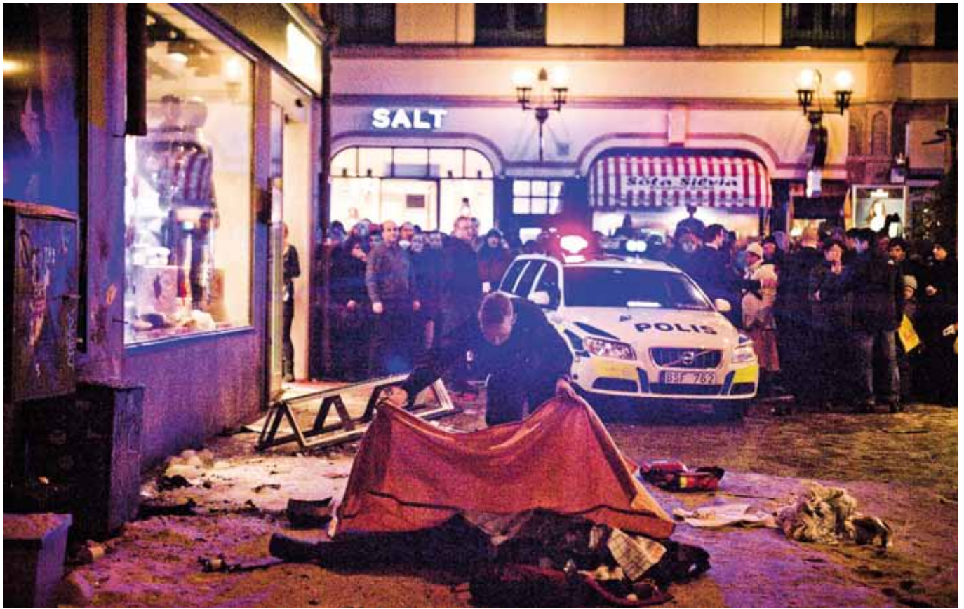
Terrorism is not remote. Terrorist attack in Stockholm in 2010