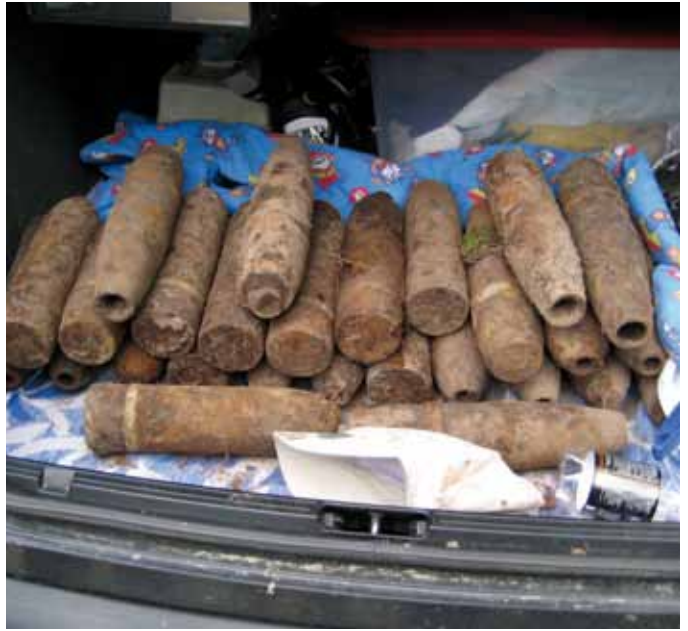
World War II explosive ordnances taken from detectorists

kg of explosives in the basement of his house. He had scraped the explosive material out of shells found in a Harjumaa forest. On 29 January 2010, in the course of investigations, the Security Police confiscated the explosive material as well as 15 rounds from a hand gun.