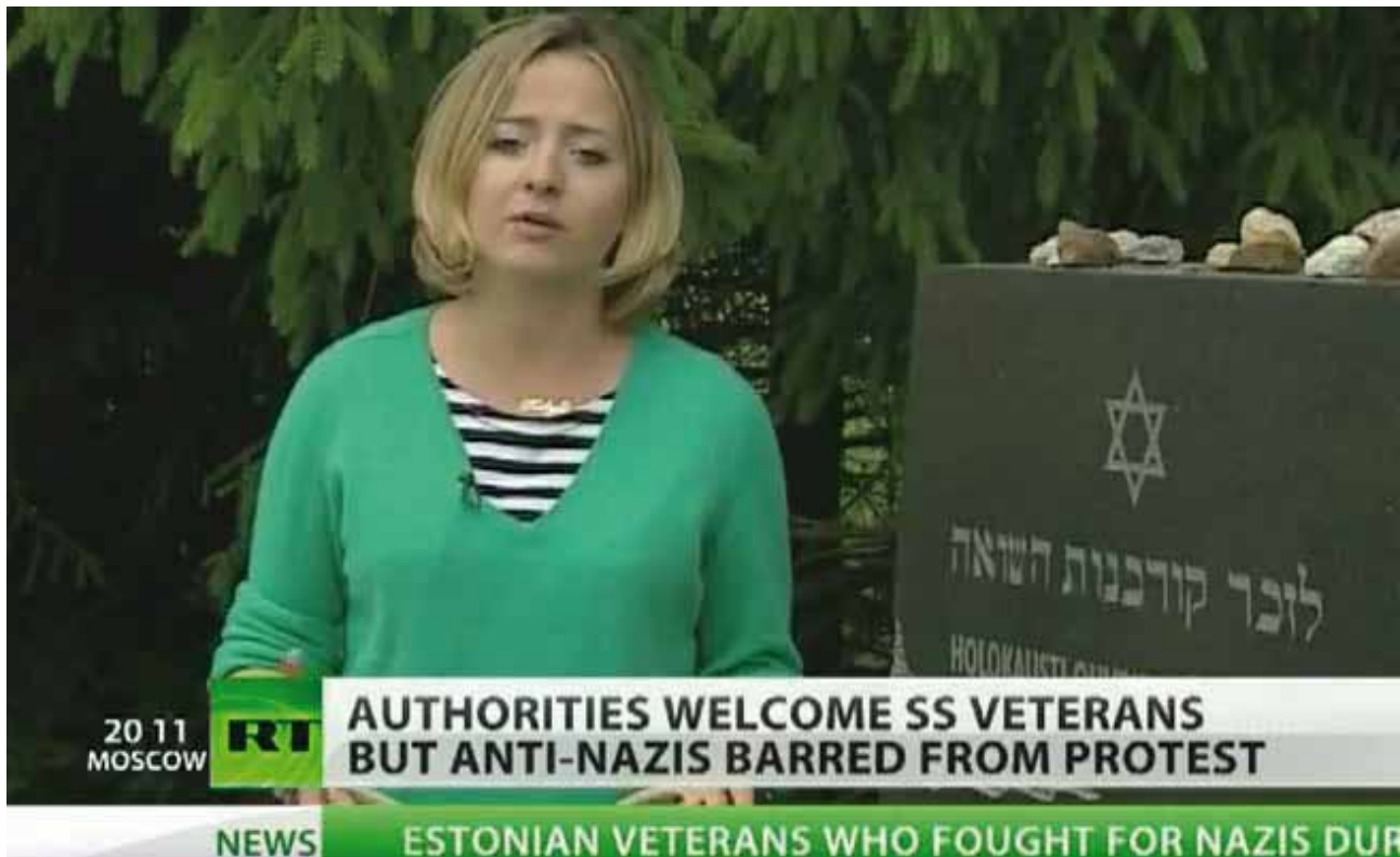
Russia Today journalist covering the commemoration of the battles at Sinimäed Hills

The Bronze Soldier can no longer be used as a source of conflict and, therefore, Russia is trying to find a new irritant, in order to bolster the myth of the Soviet Union as a liberator and to portray resistance to the occupation as a manifestation of nazism. For the past 17 years, commemorative events attended by former World War II soldiers who fought on the front have taken place in Virumaa. The events are similar to those that take place elsewhere in the world. In 2010, Russian media representatives were more numerous at Sinimäed Hills than in previous years. They portrayed what was a peaceful gathering without any disturbances, as the manifestation of a new wave of state-sanctioned nazism in Estonia and as a radical attempt at reevaluating history. Later many additional news stories portraying Estonia as a Nazi state were aired. Unfortunately, local media helped to significantly amplify Russia's message