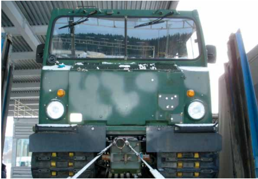
A BV 206 all terrain carrier that was attempted to transport from Sweden to Russia via Estonia