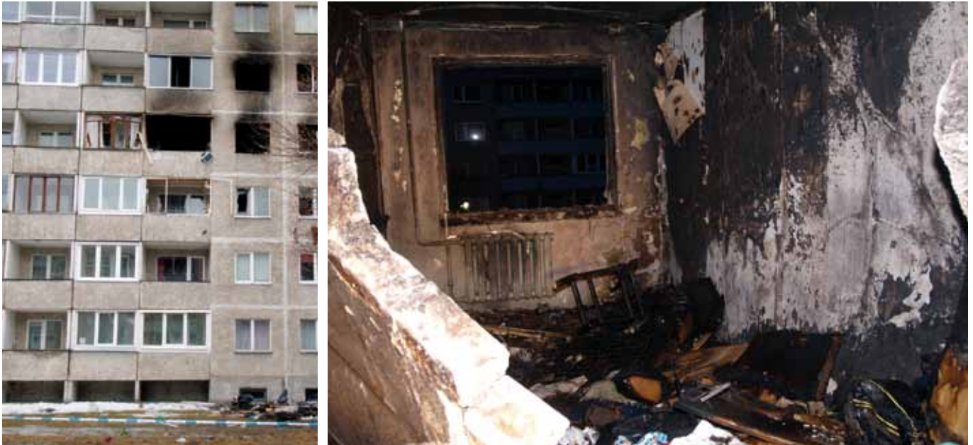
The consequences of the explosion on Kuldnoka Street in Tallinn

a counterterrorism exercise called Cruise Ship 2010. Special forces practiced landing onto a moving ship from an aircraft and vessel, taking control of the ship and its communications, defusing explosive ordnances, freeing hostages and other tactical activities.