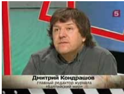
FOTO: Channel 5 propaganda. 'The Russian and Slavic languages department was moved from the university's main building to a former morgue' — the University of Tartu's anatomical building on Kassitoome. Kondrashov claimed in the talkshow that 'there is ethnic genocide in Estonia!'