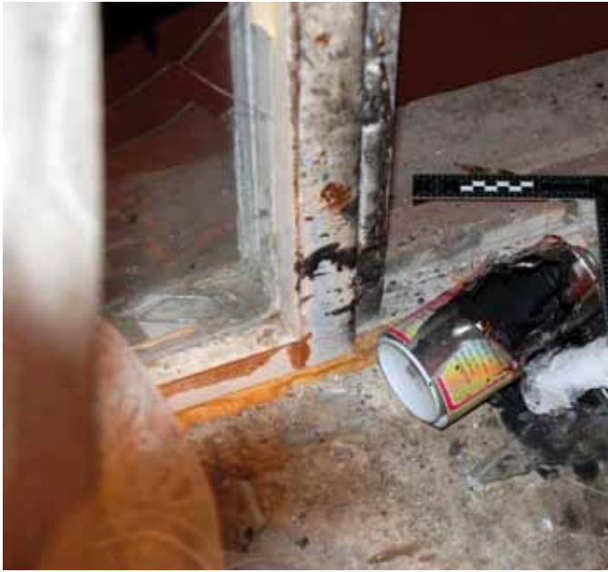
The consequences of an explosion created by a detonator containing just 2 grammes of explosives. A similar explosion in a person's hands would probably result in the loss of one or many fingers.