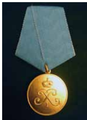
Medal commemorating the 300th anniversary of the uniting of Livonia and Estonia with Russia