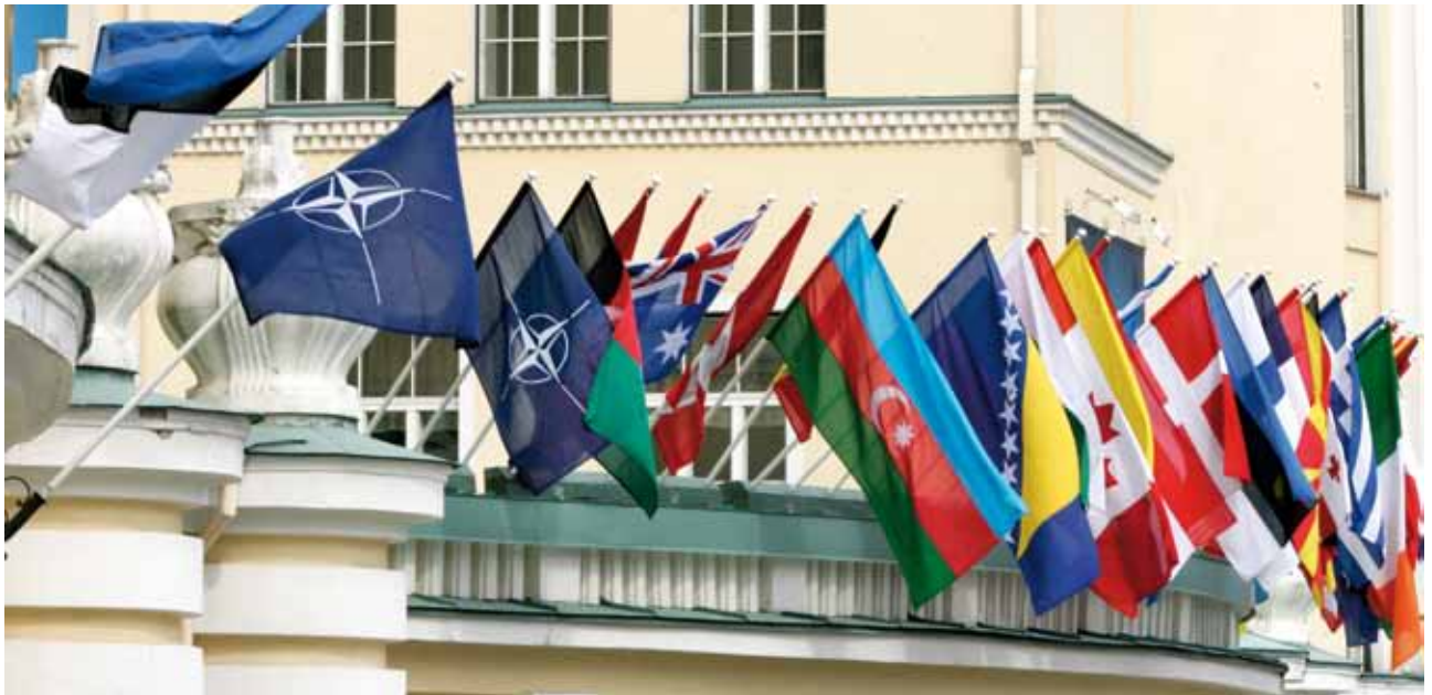
The informal meeting of NATO Foreign Ministers in Tallinn on 22-23 April 2010