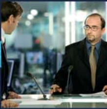
Top Story at 08:45