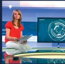
Tech 24 on Wednesday at 16:40