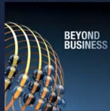
Beyond Business on Saturday at 10:15