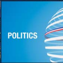
Politics on Thursday at 16:10