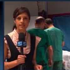
Health on Sunday at 11:45

News bulletins and world weather every half hour