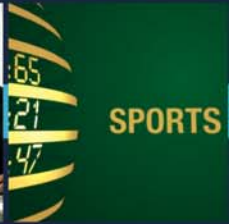
Sports at 06:10*