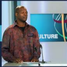
Culture critics at 09:45