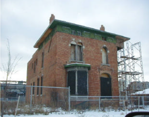
216 Winder, 2003

Local v 2/8/80 State v 1/16/90 State Marker National