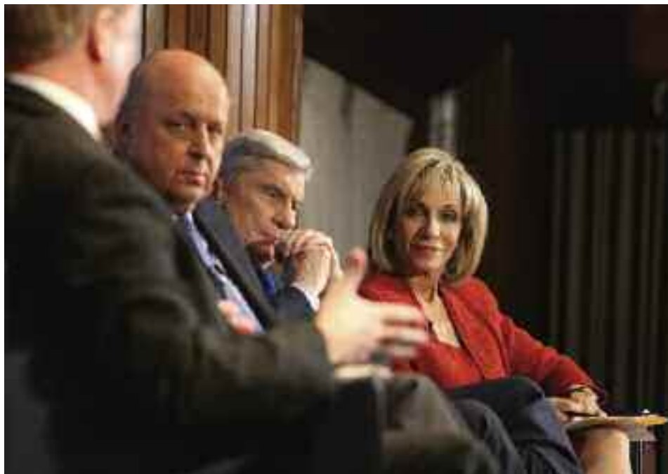
Sen. Jim Webb, John Negroponte, John Warner, and Andrea Mitchell