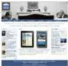
The Miller Center’s new home page