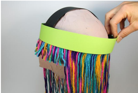
11. Instead of covering the whole head, try making a hat or crown.