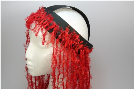
12. Red feather wool.