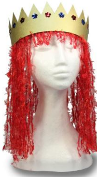
Red Feather Wool