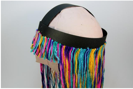
10. Coloured wool and double sided tape.