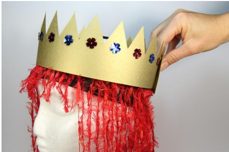
13. Adding a paper crown.