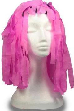
Pink Crepe Paper