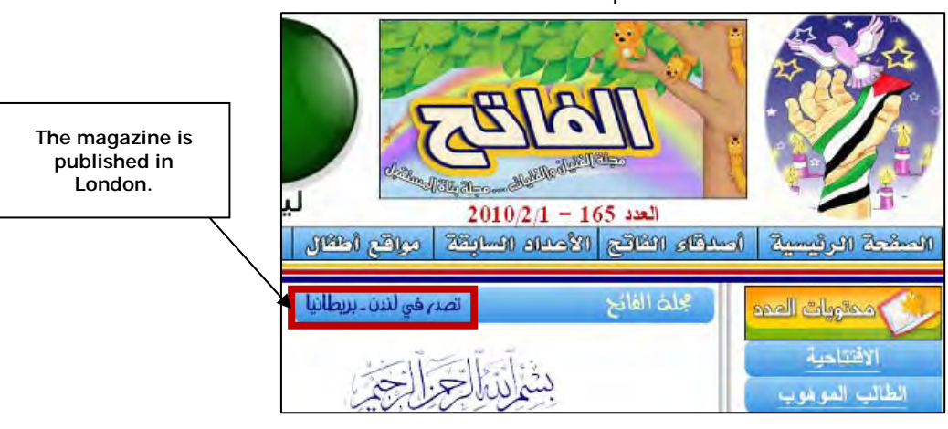
The home page of Hamas' biweekly children's magazine, Al-Fateh, February 2010.

2) The monthly Filastin al-Muslima , Hamas' main publication, has been issued in London since 1981. It spreads hate propaganda against Israel and encourages terrorism and terrorists. It is published in both hard copy and online. In the past its address in London appeared on the front page but currently no address is listed. However, subscription prices for Britain, Europe, the United States and Canada are all listed in pounds sterling (as of January 2010), an indication that its activity is still centered in Britain. The paper also owns a publishing house called Filastin al-Muslima Publications which in the past issued books glorifying the deeds of Hamas operatives (such as Salah Shahadeh, Yehia Ayash and Imad Aqel) and praising suicide bombing terrorism (in which Hamas played a leading role). It is unclear whether the publishing house continues its activity in Britain. Its ISP is the same Russian company which provides Internet services for Al-Fateh .<sup>5</sup>