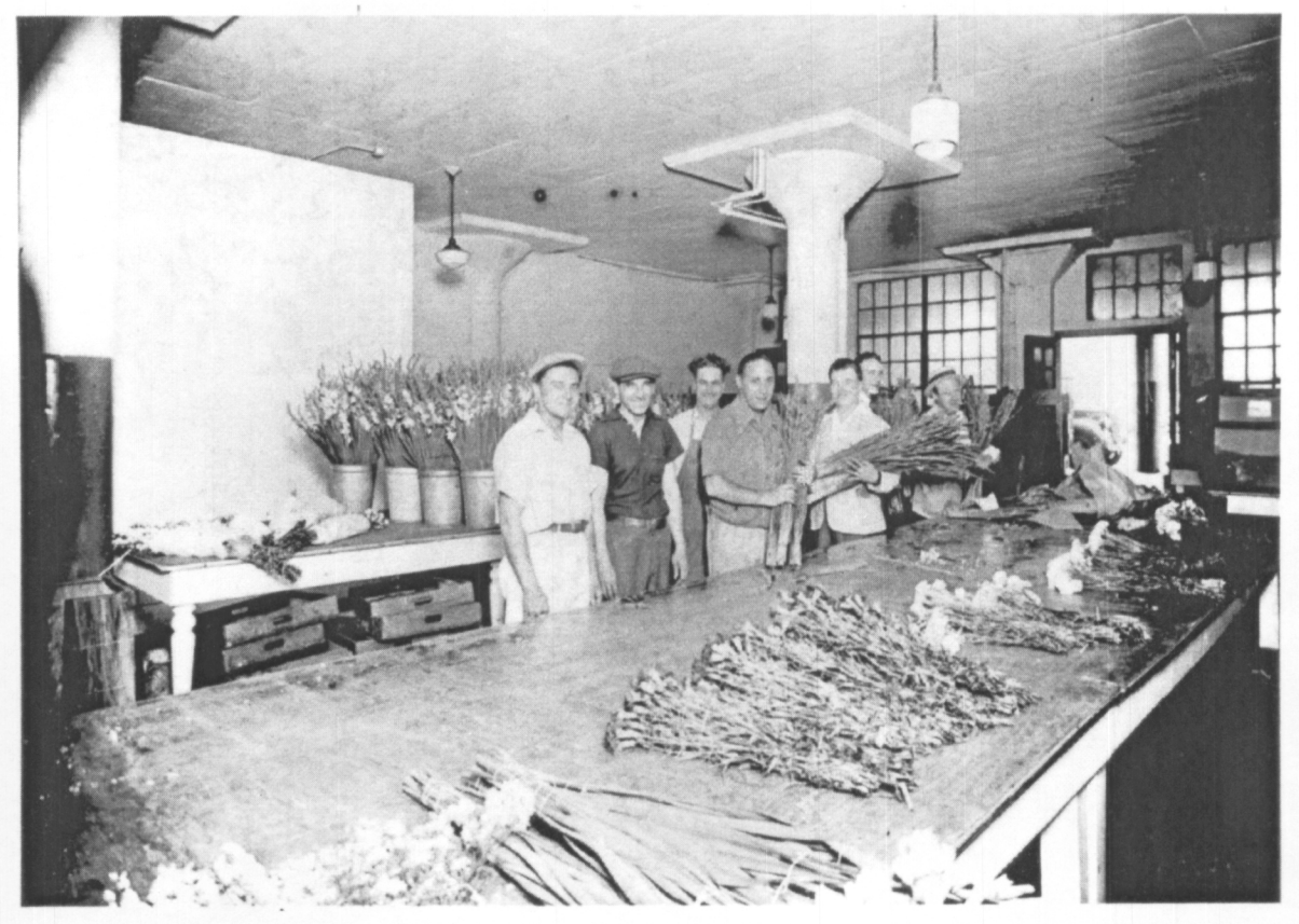
Kennicott Brothers employees at the Wholesale Florists Exchange, circa 1930

Wholesale Florists Exchange Name of Property Cook County, IL County and State N/A Name of multiple listing (if applicable)