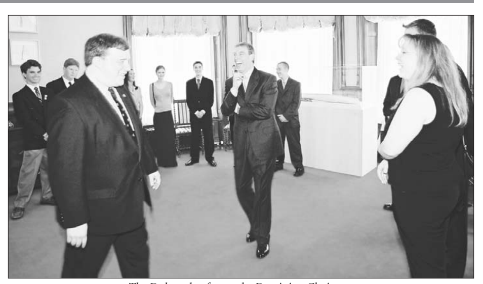
The Duke pokes fun at the Dominion Chairman