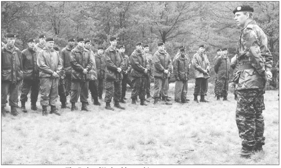
The Duke of York addresses his troops on manoeuvres.

Next The Duke was taken to see Queen's York soldiers in a tactical hide. Another task of the reconnaissance unit is to see without being seen. Soldiers are placed in a geographic location were they