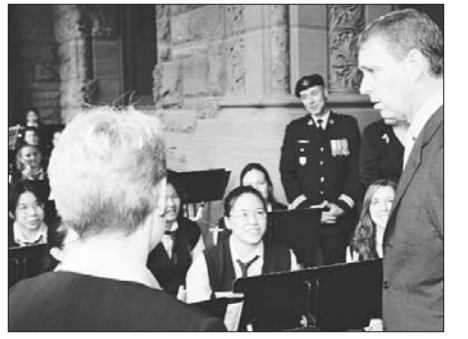
...and meets the Band...