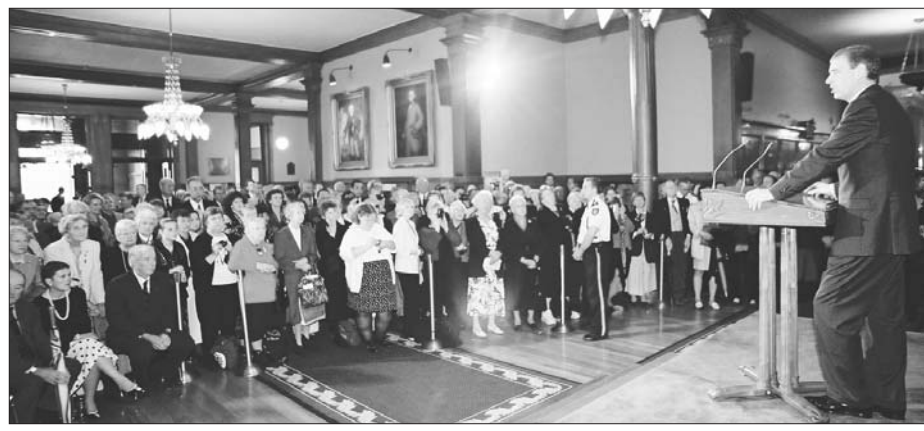
HRH addresses Monarchists...