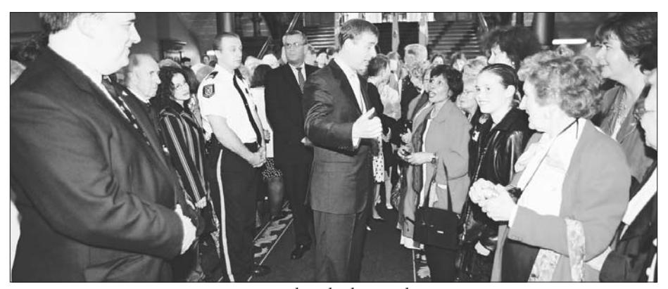
...and works the crowd