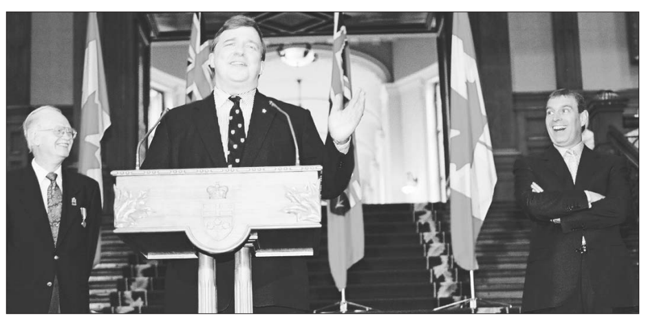
A joke on the Grand Staircase of the Ontario Legislative Assembly