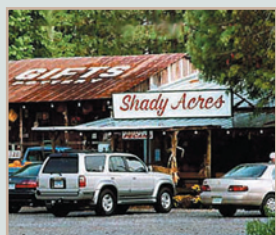
"Watermelons, apples, bananas and tomatoes. Just waiting for you."

Begin your tour of Covington County in the small town of Mt. Olive, just a short drive up Hwy. 49, north of Collins. Powell Drug Store built around 1900 serves this community as both a pharmacy and a unique gift shop.