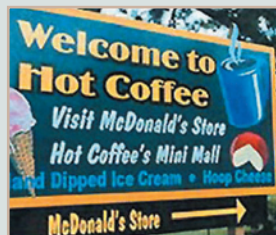
"There's a lot more to the town of Hot Coffee than, well-- hot coffee."