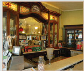
"Enjoy stepping back in time at Powell Drug Store in Mt. Olive."