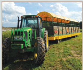
"Country roads often give the impression that a treasure is waiting just around the curve."