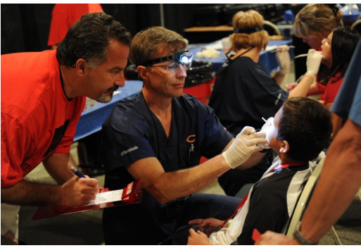
Team Smile doctors saw hundreds of young patients during the Back-to-School Fair.