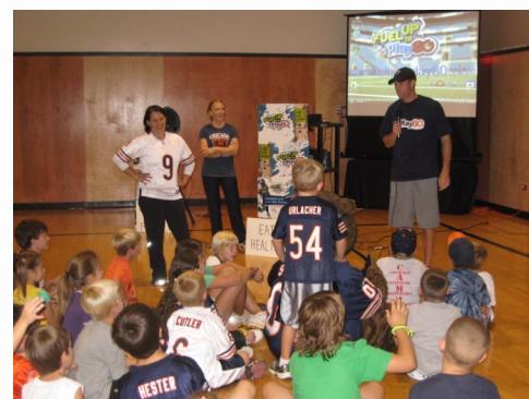
Robbie Gould hosted a Football/ Fitness Clinic at Midtown Athletic Club.

Kicker Robbie Gould and Bears mascot Staley hosted a Football/ Fitness Camp for boys and girls ages 6-14 at Midtown Athletic Center in Palatine on Tuesday, September 14. Robbie led over 50 kids through a variety of exercises using the innovative HOPSports Training System, which is a component of Midwest Dairy Association's "Fuel Up to Play 60" program. Robbie also participated in a Q & A with some very curious youngsters and signed autographs following the fitness clinic. This event served as the official kick-off to the 8th Annual Midtown 5K Run & Walk, which took place on Saturday, September 25. Proceeds from the race benefited Bears Care, the charitable beneficiary of the Chicago Bears.