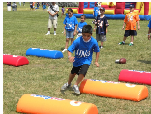
A youngster from UNO sharpened his skills at Gatorade Junior Training Camp.

The Bears celebrated Hispanic Day at Training Camp on Sunday, August 1 and invited children and their families associated with United Neighborhood Organization (UNO) down to Bourbonnais for the afternoon. After participating in Gatorade Junior Training Camp, the group enjoyed watching the team practice. Bears Care, the charitable beneficiary of the Chicago Bears, also presented a $20,000 grant to UNO for support of the UNO Charter School Network Co-ed Flag Football League.