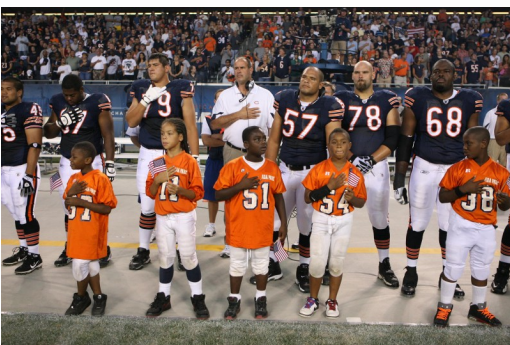
The Bears celebrated "USA Football Day" at Soldier Field on August 28, 2010.