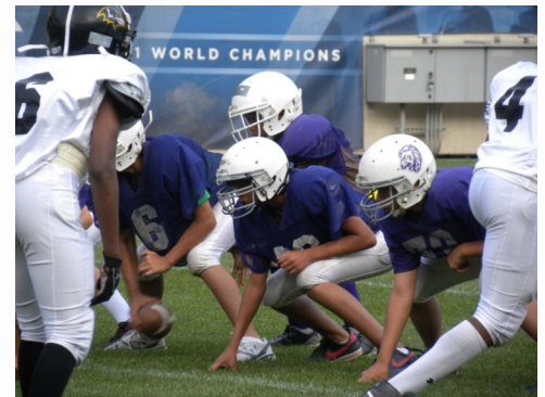
Players from the CPD's Junior Bear Tackle league showed off their skills prior to Family Night at Soldier Field.

To see pictures from Comcast Bears Family Night presented by Chase, check out the photo galleries on ChicagoBears.com by clicking here .