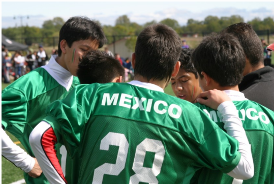
Los Diablos talked over their game plan during the NFL Flag Football Regional Tourney.