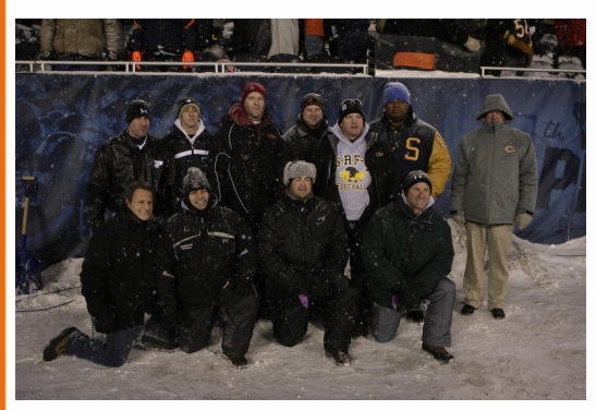
The 2010 Bears "Coach of the Week" winners were honored during a snowy game at Soldier Field on December 12