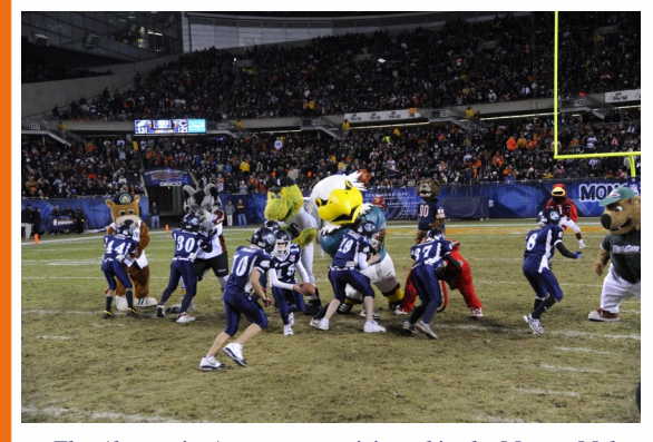
The Algonquin Argonauts participated in the Mascot Melee Bowl as part of the Bears PLAY 60 festivities.