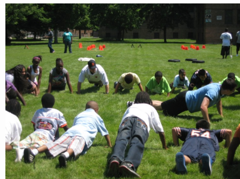
Kids from the Cotter Boys & Girls Club "Played 60" during a visit by George McCaskey and D.J. Moore.

The "First Down for Fitness" challenge is one component of the Chicago Bears commitment to the NFL's "PLAY 60" initiative, which focuses on making the next generation of youth the most active and healthy.