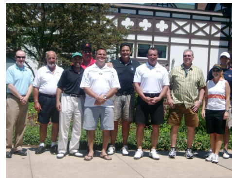
2010 marked the 16th year the Bears and North Park University have partnered to present “Golf for Kids.”