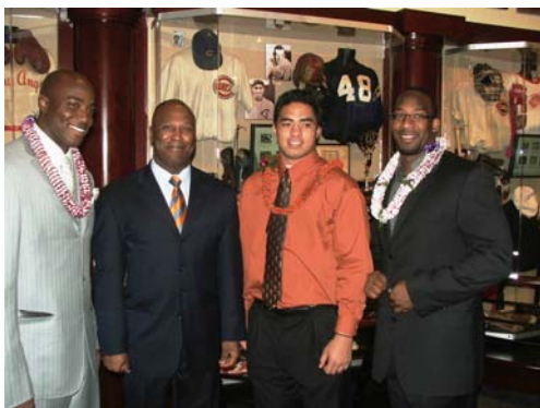
Lovie Smith posed for a photo with the three winners of the 2009 Butkus Award.