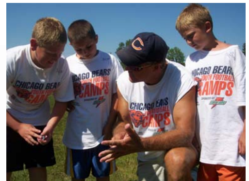
Chicago Bears Youth Football Camps will be held in 29 different neighborhoods throughout Chicagoland in 2009.

By bringing the camps to local communities, the Bears are making safe, high quality football instruction available to children throughout Chicagoland. Registration is now open and "early bird" discounts are available. For more information or to register, please visit www.BearsCamps.com or call (312) 226-7776.