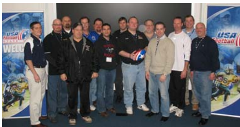
The Chicago Bears and USA Football hosted the youth football Chicagoland Leadership Forum at Halas Hall.

One of the resources they are currently offering, the "Recession Survival Guide," can be downloaded from their web site: www.UWLakeCo.org . This comprehensive guide features information about how to file for unemployment, how to make a financial action plan, where to find housing and food assistance, and it also offers employment resources such as resume assistance, interviewing tips and job skills. The Chicago Bears have a long-standing relationship with the United Way of Lake County and the United Way of Metro Chicago, and we are proud to recognize them as the Bears "Charity of the Month" on www.ChicagoBears.com/community .