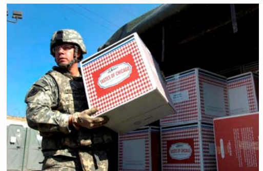
Pizzas that Brad Maynard and Adrian Peterson helped ship arrived in Afghanistan and Iraq in time for the Super Bowl.

Pizzas 4 Patriots is a non-profit organization with the mission of making a positive difference in the lives of service men and women. Their goal is to provide our Armed Forces with gifts from home through financial donations and product and service donations from organizations. Pizzas 4 Patriots strives to make the soldiers feel they are remembered and appreciated by the country and residents who enjoy the freedoms that they provide for us. For more information about Pizzas 4 Patriots , please visit www.Pizzas4Patriots.com .