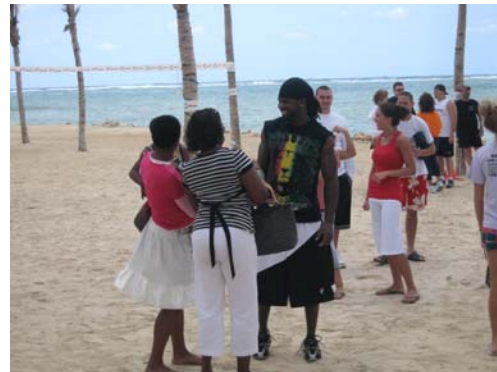
Devin Hester visited with volunteers from the Pediatric Clinic in Negril.