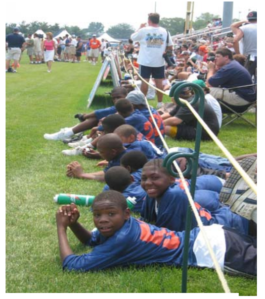
Youth football players from the CPD Junior Bear Tackle League watch the Bears practice.

Other special guests of the Bears during Training Camp included a group of 120 youth football players from the Chicago Park District Junior Bear Tackle League on Wednesday, August 3. The youngsters were put through various drills by football players from Olivet Nazarene University at Junior Training Camp before enjoying lunch and watching the Bears afternoon practice from a VIP area. This is the fourth year in a row youth football players from the Junior Bear Tackle League have visited Training Camp, and the day proved to be a huge success once again!